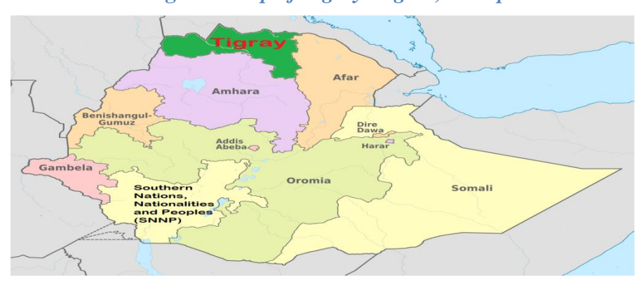
Figure 2 Map of Tigray Region, Ethiopia

The Tigray region, officially the Tigray National Regional State, is the northernmost regional state in Ethiopia. The Tigray Region is the homeland of the Tigrayan, Irob, and Kunama people. Its capital and largest city is Mekelle. It has a population of 7.07 million (2020) and an area of 50,079 km<sup>2</sup>. Tigray is the fifth-largest by area, the fifth-most populous, and the fifth-most densely populated of the 11 regional states in Ethiopia. Tigray is bordered by Eritrea to the north, Sudan to the west, the Amhara Region to the south and the Afar Region to the east (Wikipedia, 2022).