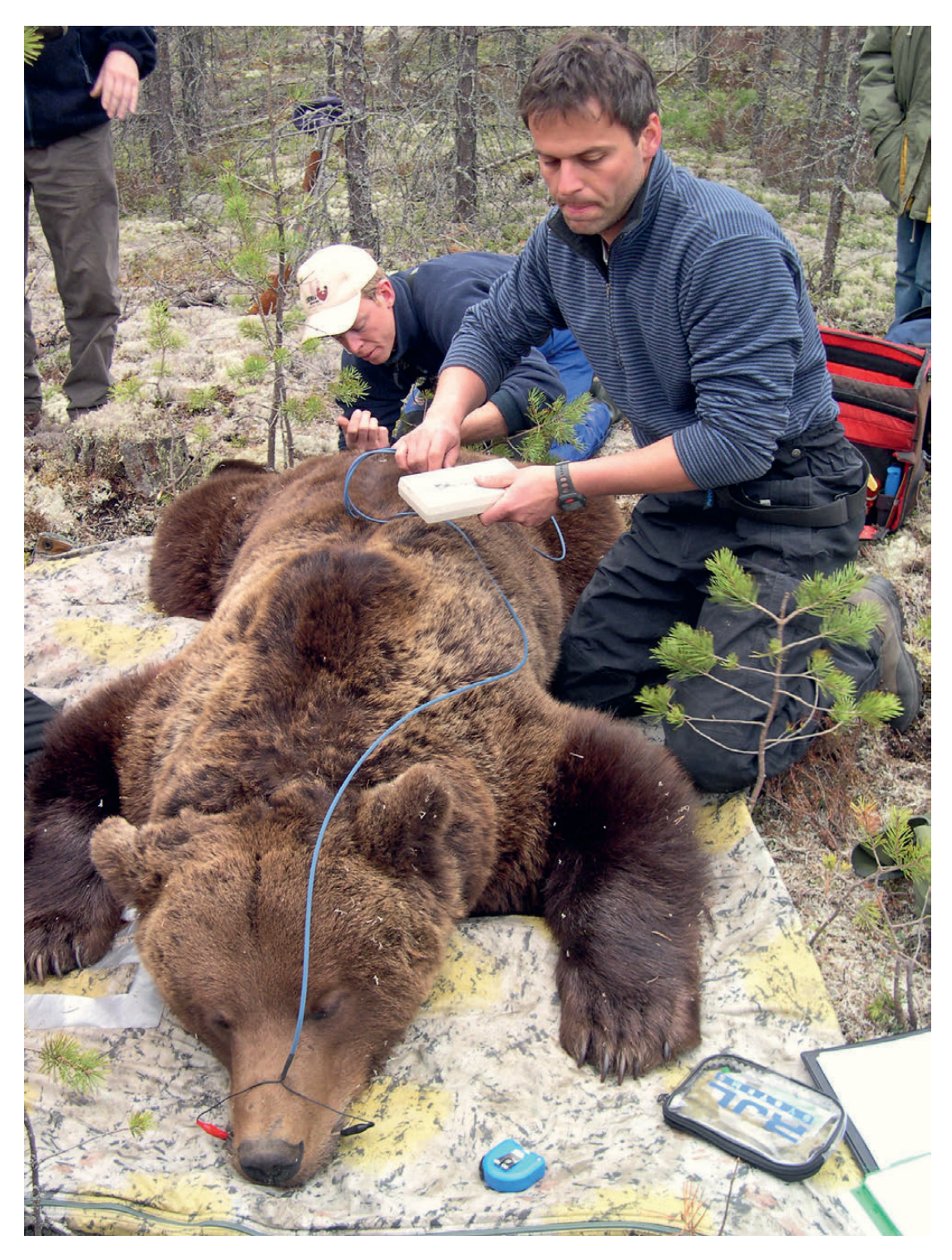
Fig. 1. Researchers measure the body fat composition of a sedated five-year-old male brown bear after hibernation. Bioelectrical Impedance Analysis is used, i.e. a very weak electric current measures the body fat content of an individual.