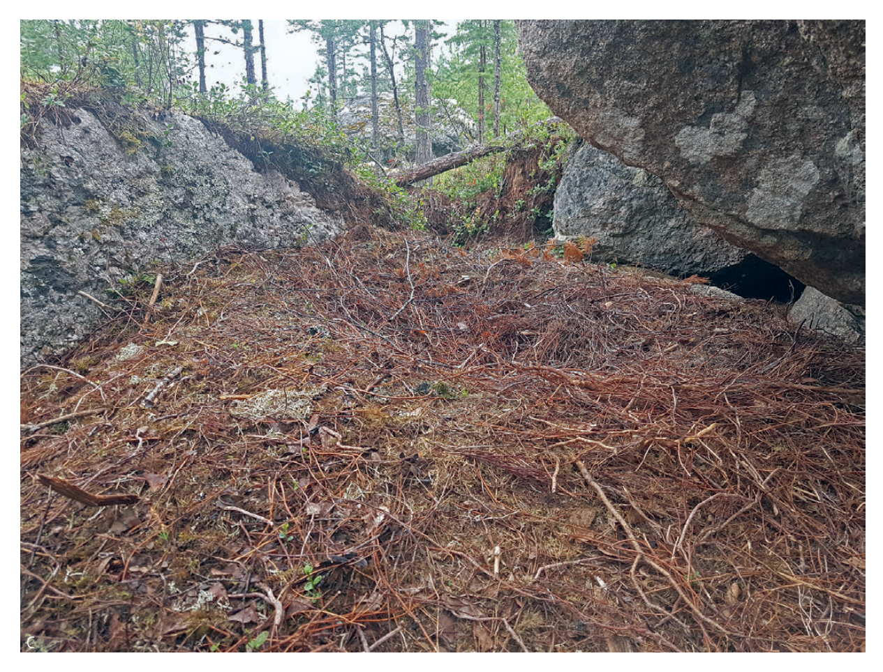
Fig. 2. Den types used by brown bears in Scandinavia. a: Excavated ant hill den; b: Entrance to a natural rock cavity den; c: Open nest den.