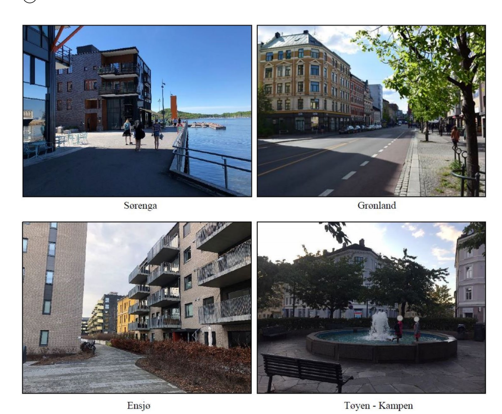
Figure 3. Urban spaces in the four neighbourhoods.

also asked whether residents perform a series of activities locally in their neighbourhood. The question was phrased as 'Do you spend your free time/participate in any of the following activities in... (name of neighbourhood)?'. The answer options were: 'sports, 'cultural activities', 'local religious and spiritual organizations', 'local