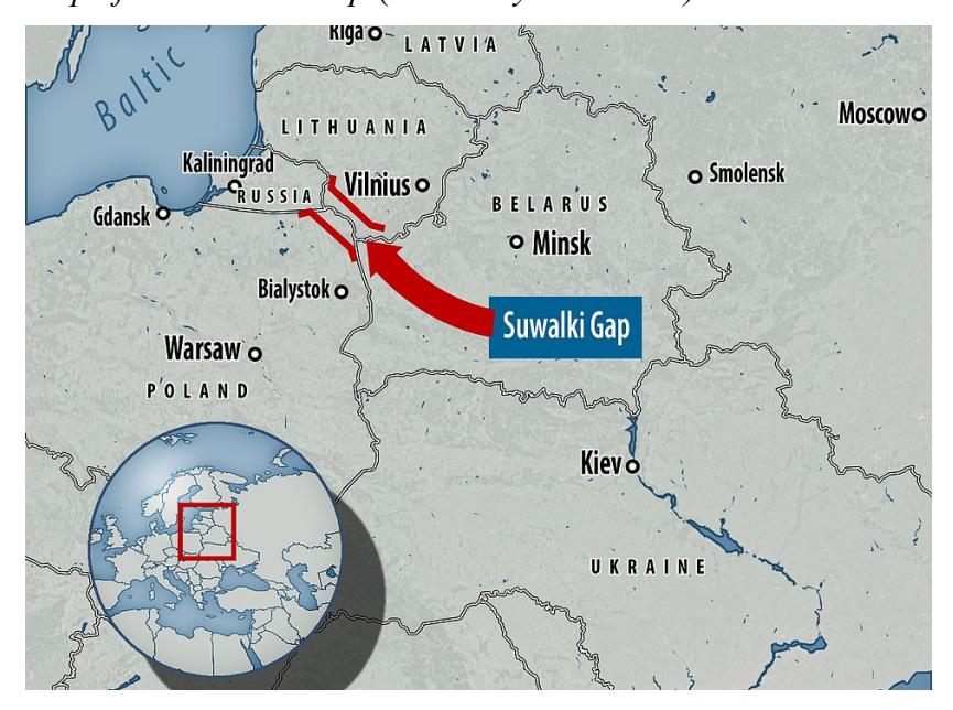
Map of the Sulwaki Gap (The Daily Mail 2022)