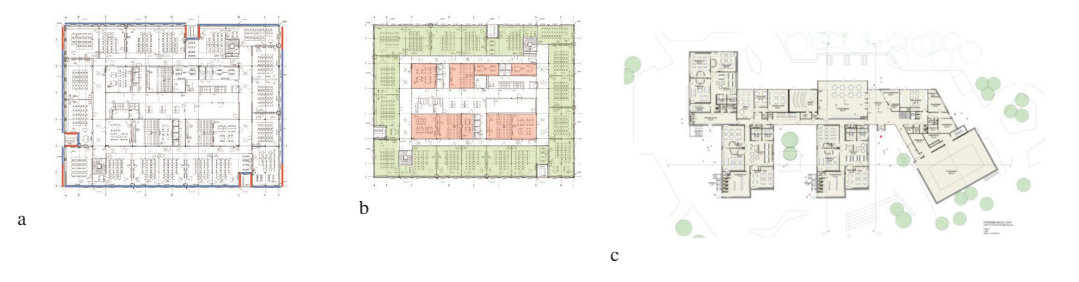
Fig. 2. Example: Marienlyst School, Drammen (a); Measuring façade meters per class, blue lines are counted, while red lines are not counted. The average FMC for this school was measured to be 9.4 m (168.6 façade meters/18 classes). (b); This illustration demonstrates the amount of teaching area without direct daylight access. Teaching rooms with daylight are colored green, while teaching rooms without daylight are colored red. c) The Rykkinn competition; winner project

The FMC value was developed in the earlier research mentioned above (Houck, 2013) and was defined as the façade meters spent on classroom, group study room and teaching areas related to the main teaching activities – divided on the number of school classes the respective school was dimensioned for. We are interested in measuring the façade meters that can be distributed into to various rooms and provide daylight. Therefore, the first 8 meters around a corner are not counted, as this would only provide the possibility for daylight in a room where we have already measured an outer wall. See figure 2a.