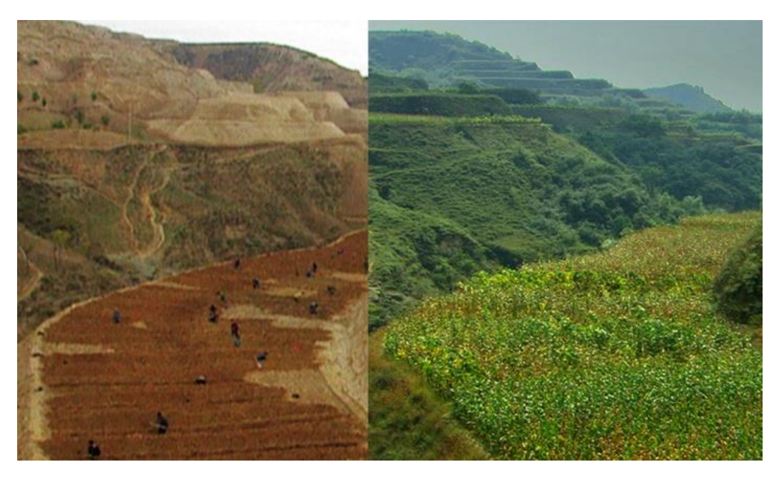
Figure 1. Loess Plateau Restoration before (1995) and after (2009).