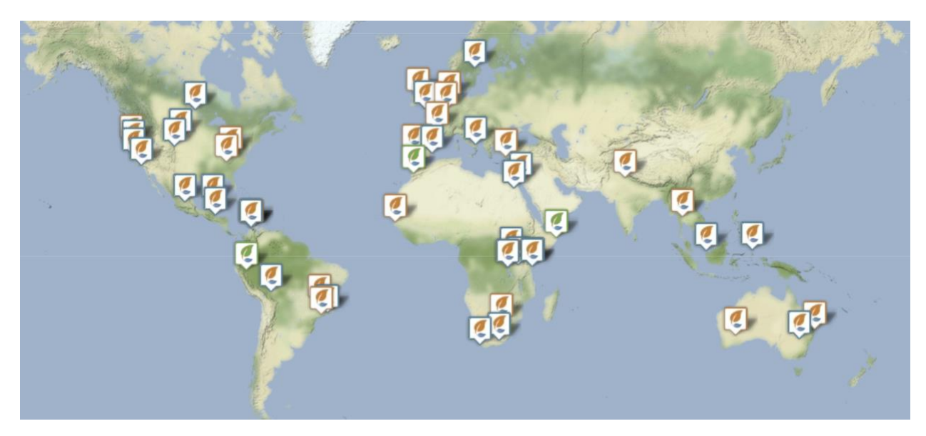
Figure 2 Global map of ecosystem restoration camps in March 2022.

After identifying ERC as the overarching context for the case study it was necessary to further narrow the focus of the context to a particular location within this network of camps. A range of factors were considered in selecting a site to study, including proximity to Norway, site availability, and the degree to which agriculture and ecosystem restoration were integrated in the project. Many of the camps within the network are still in the early stages of development, which further limited the range of camps being considered.