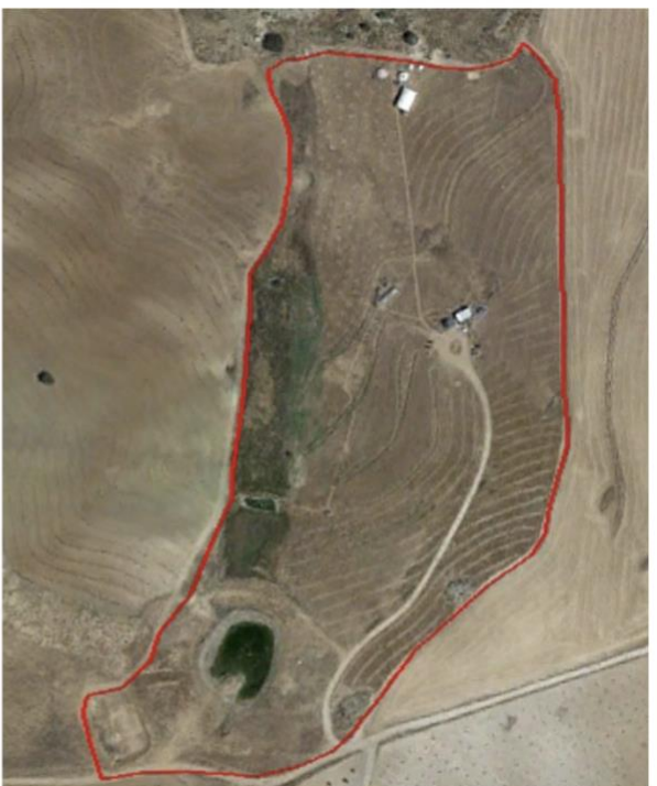
Figure 3: Aerial view of Camp Altiplano in August 2014 (left) and August 2019 (right).

Camp Altiplano was also an attractive study context because of its focus on the agroecological restoration of farmland. As part of La Junquera, Camp Altiplano is focused on creating a commercially viable and agroecological model of agriculture that combines regenerative agriculture with biodiversity restoration and farmer livelihood improvement. The 5-acre camp site is located on La Junquera, a 1100 hectare farm in the agricultural region in Murcia in southern Spain surrounded by vast areas of heavily tilled almond monocultures and eroded soils. This region is a semiarid environment where water is often a limiting factor in agriculture