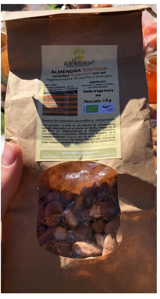
Figure 7: Regeneratively produced almonds with explanatory label.

Soil health was another common theme in respondents' prognostic frames, as it supports biodiversity and plant health while sequestering