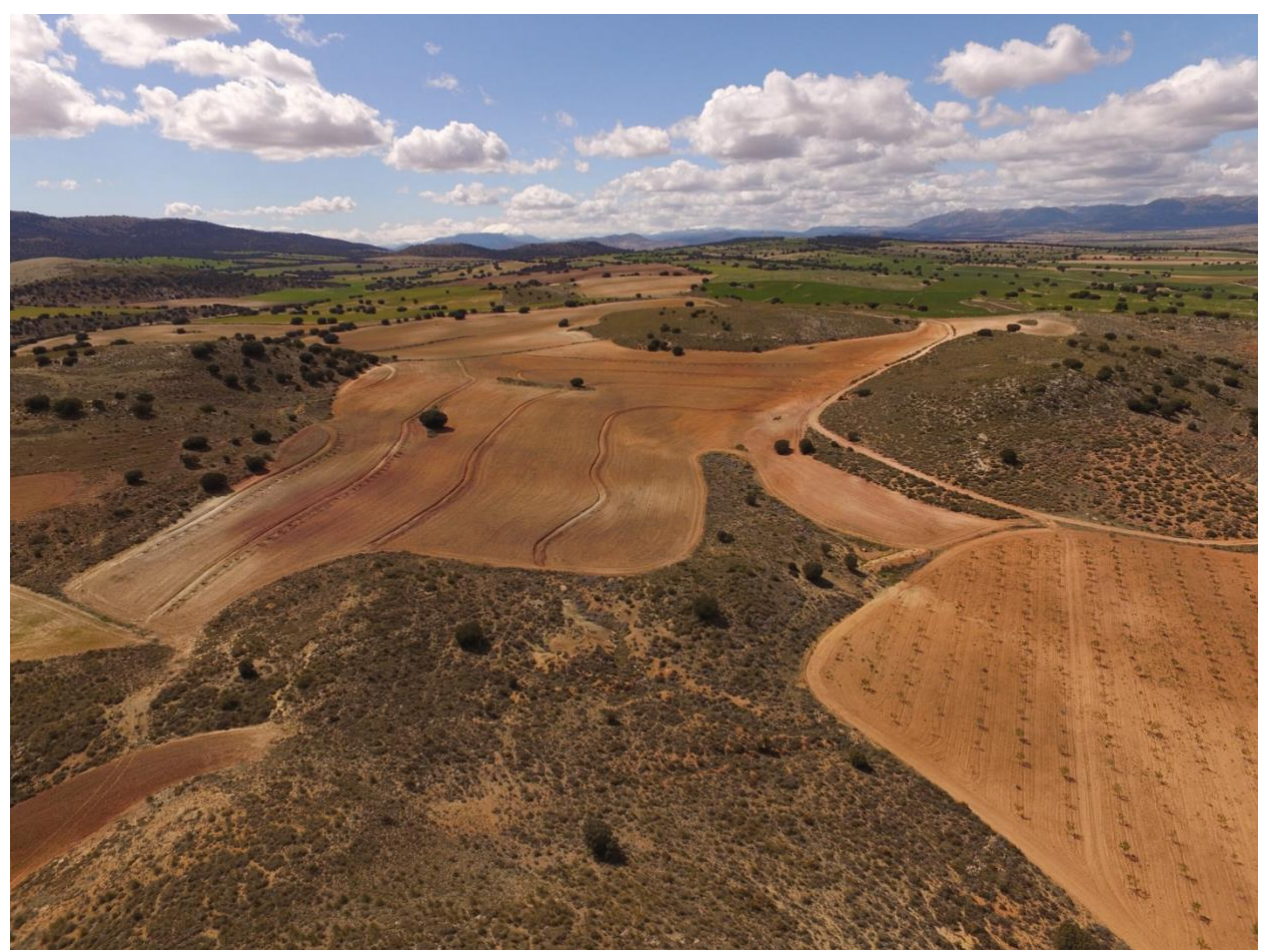
Figure 5: Aerial view of La Junquera.

in the local restoration movement by providing collective representation for farmers in dialogues with government institutions and offering shared processing space for regeneratively cultivated products. This confluence of factors in the larger system within which Camp Altiplano is embedded in signaled that the site was especially relevant to the ecosystem restoration movement, a feasible context for case study research, and that it was integrating food system transformation with ecosystem restoration, themes which were all identified as important to the thesis research objectives.