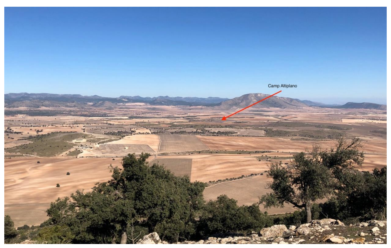
Figure 4 Camp Altiplano and surrounding landscape. Photograph taken during field work.

and most crops are rainfed. Camp Altiplano was once a monocultural grain field, and this initial state of degraded agricultural land puts Camp Altiplano in a position to demonstrate the potential pathways of restoring similar agricultural land in the region. Much of the restoration work at camp takes place on the fields, shrubland, and forest areas on the farm property using techniques including swales, keyline design, seeding of cover crops, water retention landscapes, the creation of a riparian zone, rotational grazing, agroforestry integrating almond and aromatics production, and a forest garden that is irrigated by the camp's greywater.