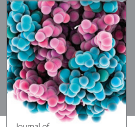
Journal of Diabetes Research