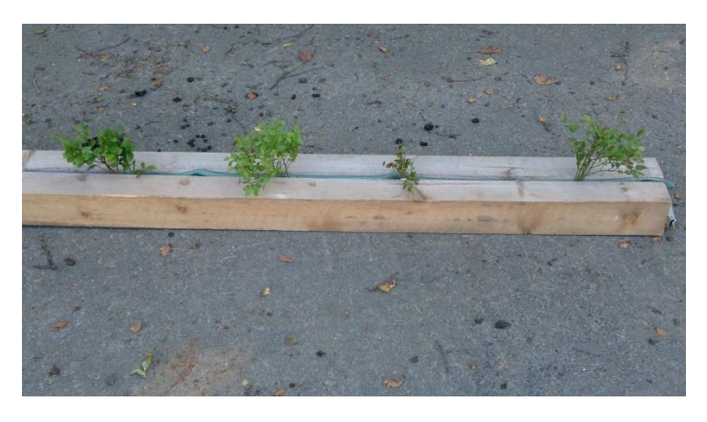
Figure 2: The frame presented to deer with plants from the four different categories.

placed in a frame and presented to deer inside an animal pen, were first choice was observed. The frame consisted of a lath that locked the plants in place at ground level. Two different strategies were used to record deer first choice: deer were released into the animal pen one by one, or all animals were released into the pen at the same