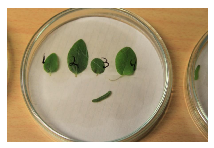
Figure 1 : Test cafeteria trial with larvae. One leaf form each of the four browsing intensities was given a random position, and a larva was placed in the middle in order to minimize influence on leaf choice.

This experiment used one leaf, from one plant, from each of the four categories. The leaf selected for the experiment was selected for its general size and healthy appearance. The size of the leaf was measured using millimeter paper, were the leaf size were the number of squares covered. If 50% or more of the square was covered, the square was counted. If the leaf