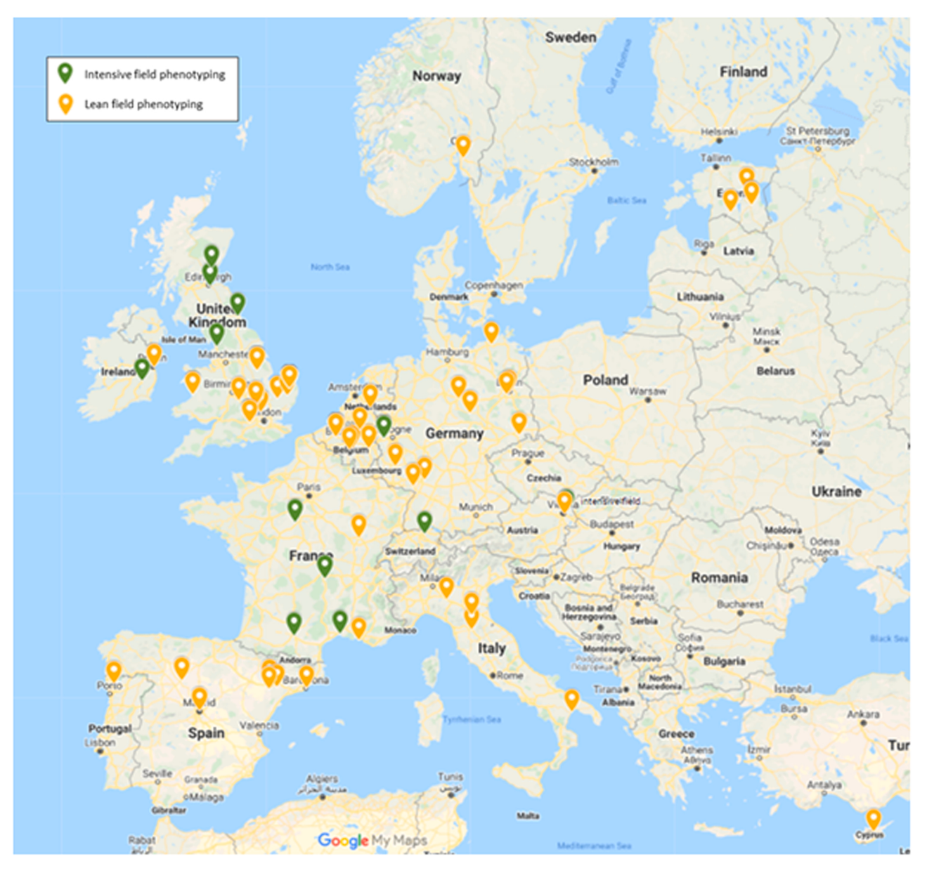
Fig. 2. Map of field phenotyping sites in Europe, mapped by the EU-funded project EMPHASIS-PREP.

quality and lower operational costs (Reynolds et al., 2019). Lean phenotyping, using affordable technologies like for example phenocarts or field phenotyping robots for proximal sensing and light-weight multispectral UAVs for remote sensing will likely be attractive for users in academia and industry with limited research budgets. Recent years have seen big advancements in the field of low-cost field phenotyping ranging from home-built phenocarts to user-friendly multispectral UAVs (e.g. DJI Phantom 4 Multispectral, https://www.dji. com/no/p4-multispectral) for use in agriculture. Recent review papers provide an overview of available low-cost phenotyping technologies for field-based crop phenotyping (Chawade et al., 2019) and breeder-friendly phenotyping solutions (Reynolds et al., 2020). In future it may be possible to develop imputation methods to bring together data from lean and extensive fields. This offers the potential for wider coverage in field phenotyping, but likely requires significant development of data processing and analyses.