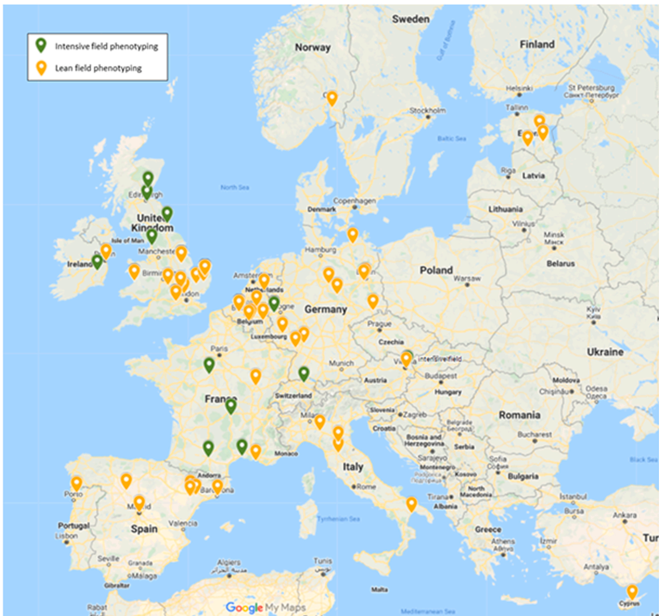
Fig. 2. Map of field phenotyping sites in Europe, mapped by the EU-funded project EMPHASIS-PREP.

quality and lower operational costs (Reynolds et al., 2019). Lean phenotyping, using affordable technologies like for example phenocarts or field phenotyping robots for proximal sensing and light-weight multispectral UAVs for remote sensing will likely be attractive for users in academia and industry with limited research budgets. Recent years have seen big advancements in the field of low-cost field phenotyping ranging from home-built phenocarts to user-friendly multispectral UAVs (e.g. DJI Phantom 4 Multispectral, https://www.dji.com/no/p4-multispectral ) for use in agriculture. Recent review papers provide an overview of available low-cost phenotyping technologies for field-based crop phenotyping (Chawade et al., 2019) and breeder-friendly phenotyping solutions (Reynolds et al., 2020). In future it may be possible to develop imputation methods to bring together data from lean and extensive fields. This offers the potential for wider coverage in field phenotyping, but likely requires significant development of data processing and analyses.