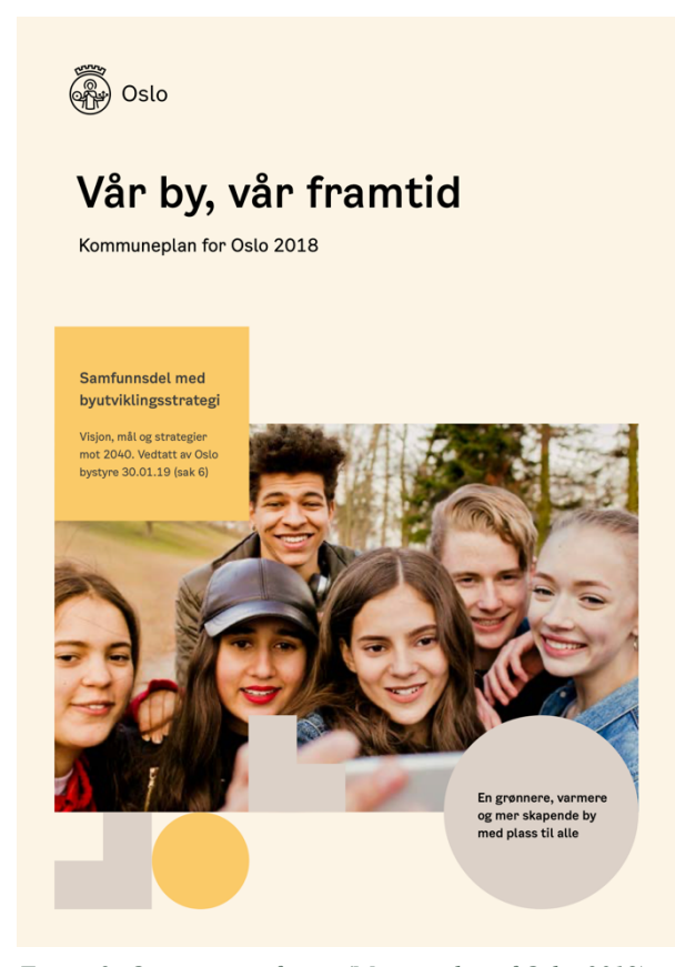
Figure 2: Our city, our future (Municipality of Oslo, 2018).

4.1.1 Social challenges and goals Population growth is emphasized as one of the main challenges in Oslo both currently and in the future and will affect a various of different sectors. The expected growth will be characterized by a higher share of elders, more young people moving to the larger city, and immigrants. Although the plan claims that population growth will be an opportunity to be more creative and multicultural, it is also connected with several social challenges and increased inequalities. For instance, while Oslo's municipal plan claims that most people are 'managing well', the fact that the capital has both the best and the worst living