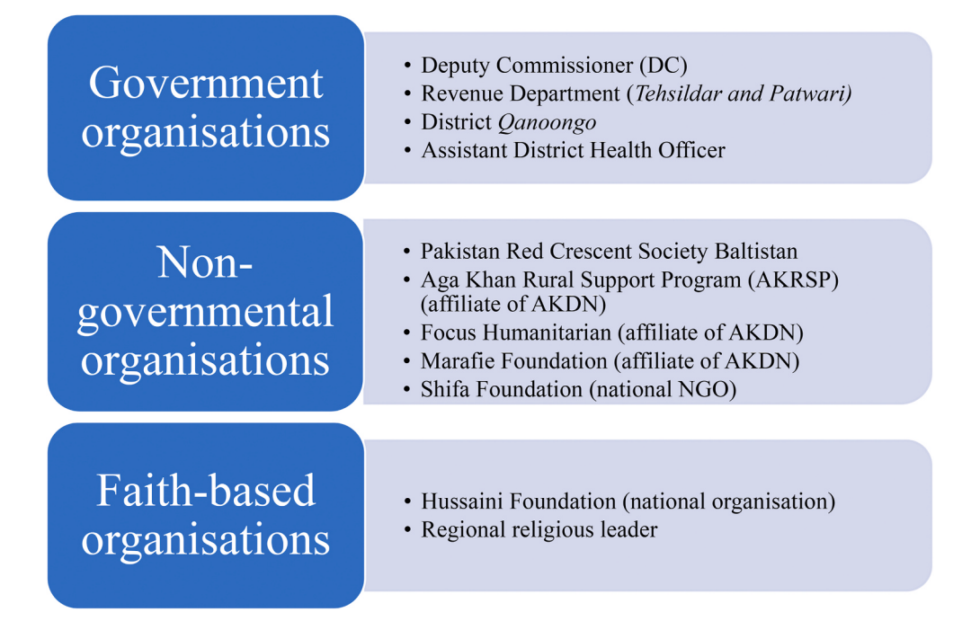
Fig. 3. Different organisations involved in the provision of assistance in humanitarian arena of Baltistan.