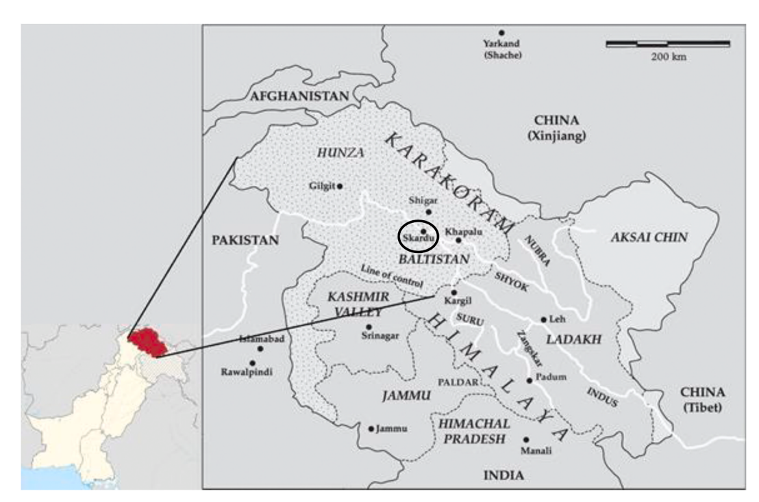
Fig. 1. Map of northern Pakistan showing Skardu's location in Baltistan.