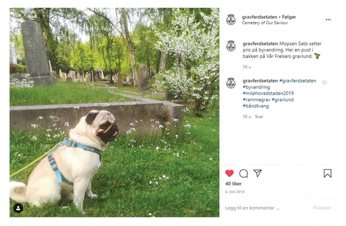
Figure 2. An Instagram post by Oslo's Cemeteries and Burials Agency showing a dog on a leash in Vår Frelsers cemetery. Comments from other users are hidden for anonymisation purposes.

management aims to communicate rules of behaviour to visitors, both through signs and the help of gardeners. Stronger communication strategies function similarly to increased physical access and lighting by reducing the extent of the liminality of cemeteries as public spaces.