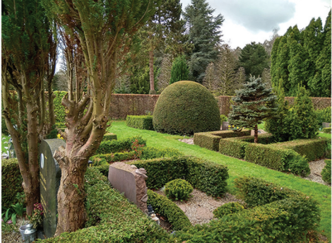
Figure 1. Typical cemetery landscape: left – open grassland in Nordre cemetery in Oslo (June 2020), and right – graves surrounded by hedges in Bispebjerg cemetery in Copenhagen (April 2018).