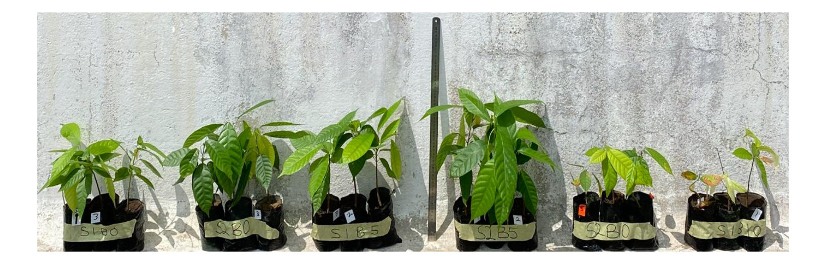
Figure 3 Picture of cocoa seedlings on the fourth month after germination.

M- Months, MG- months after germination, H- stem height, D-stem diameter, RL-root length, LAI-leaf area index, RV-root volume, SDW-stem dry weight, RDW-Root dry weight, LDW-Leaf dry weight, SLA-Specific Leaf Area, SRL-Specific root length, TDW- Total dry weight.