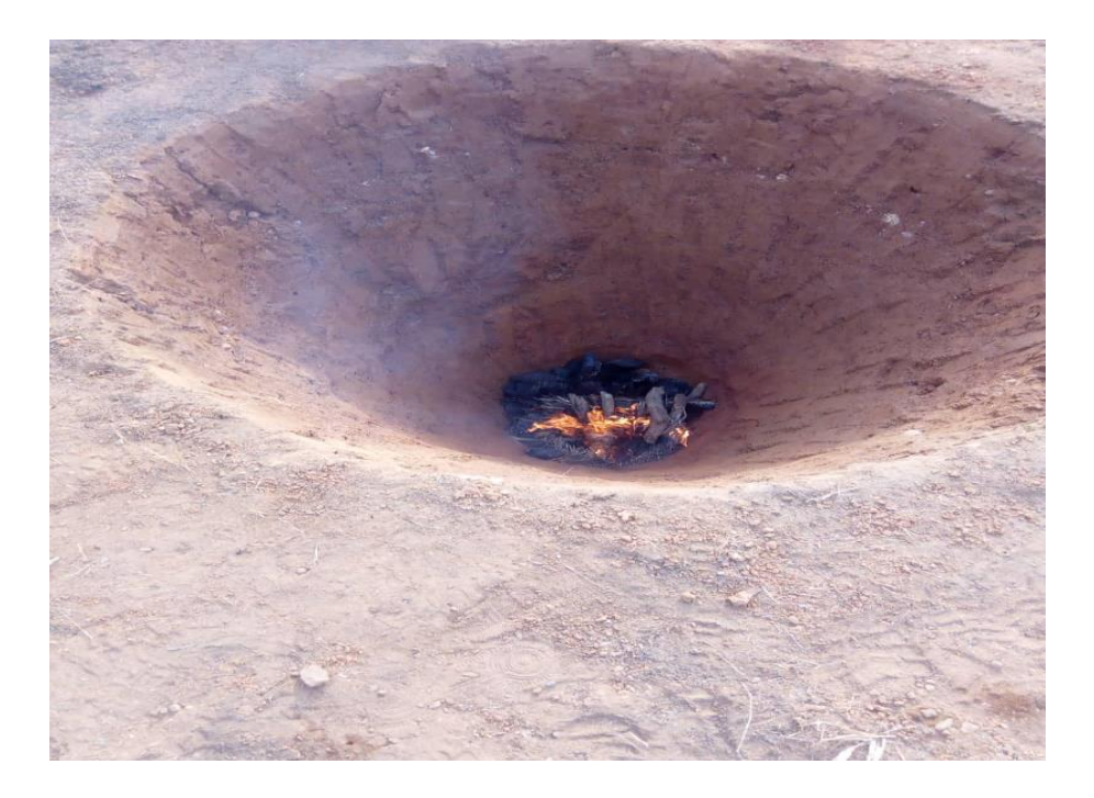
Figure 5 Beginning of pyrolysis process