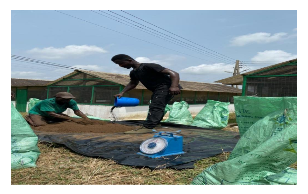
Figure 8 Mixing of biochar and soil.