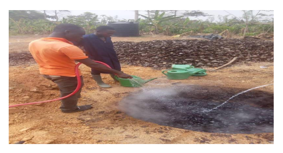
Figure 7 Quenching of fire after pyrolysis process.