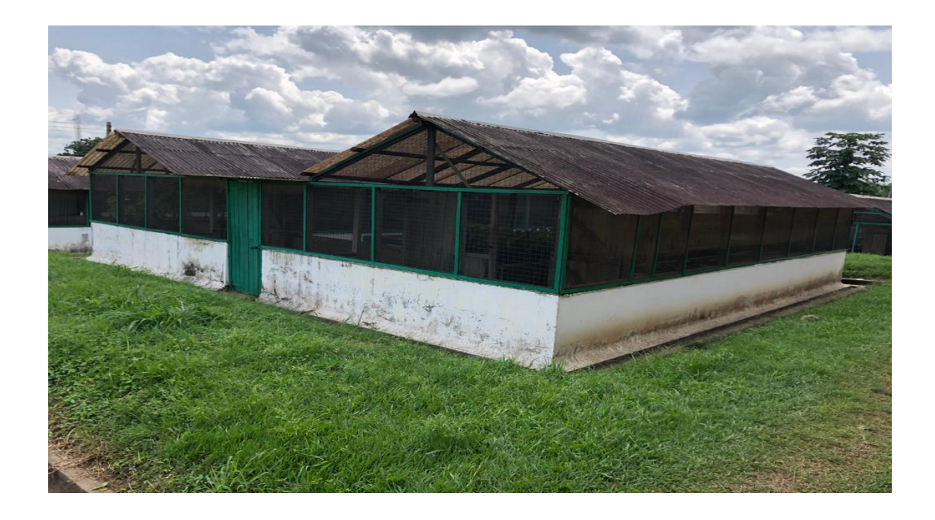
Figure 2 Greenhouse for experiment