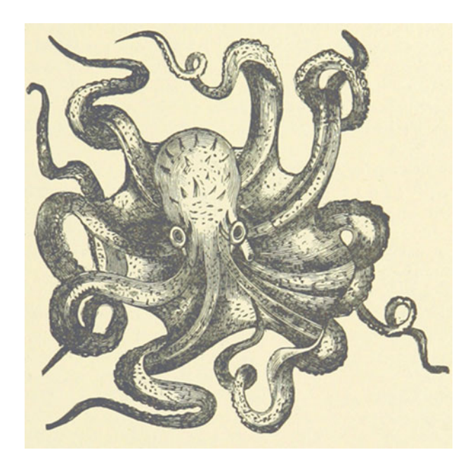
Fig. 3. octupy: oc·tu·py /ˈ äkta·pī / verb. To access and transform various institutions in an active yet constructive manner, with the dual goal of participating in and connecting with a shared goal. British Library HMNTS 10492.ee.20. BUTTERWORTH, Hezekiah, 1891.