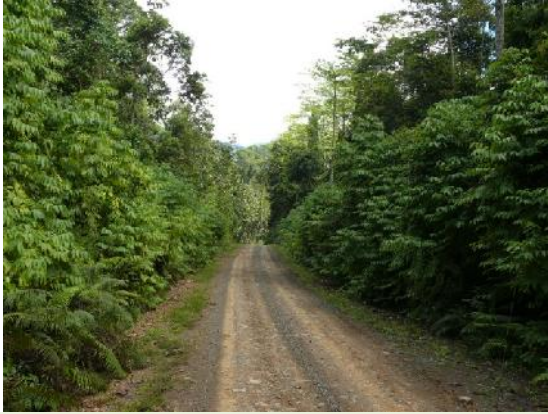
Fig. 2a. The dense cover of Piper aduncum along the old road in southern part of the concession