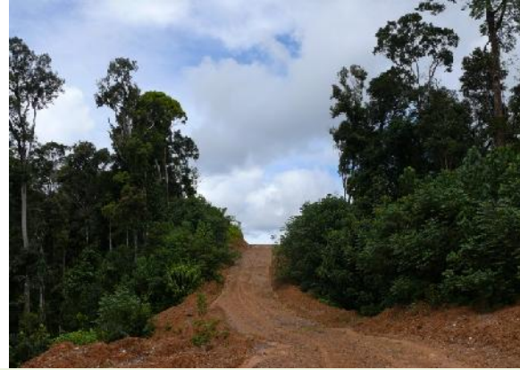
Fig. 2b. Piper aduncum remains absent along the new road in northern part of the concession

Regarding branch roads, P. aduncum occurred along Road “a” (constructed in 1997) but was absent on road “b” (constructed in 1998) where maintenance activities (including the slashing of plants on the edge of road) were being undertaken in preparation for timber extraction. In addition, we recorded two localized occurrences of P. aduncum on road “c” (constructed in 2006) leading to Mahak Village. These occurrences are at a direct (linear) distance of 82 and 88 km (and 148 and 155 km measured along the road) from Long Bagun at “Km 0”.