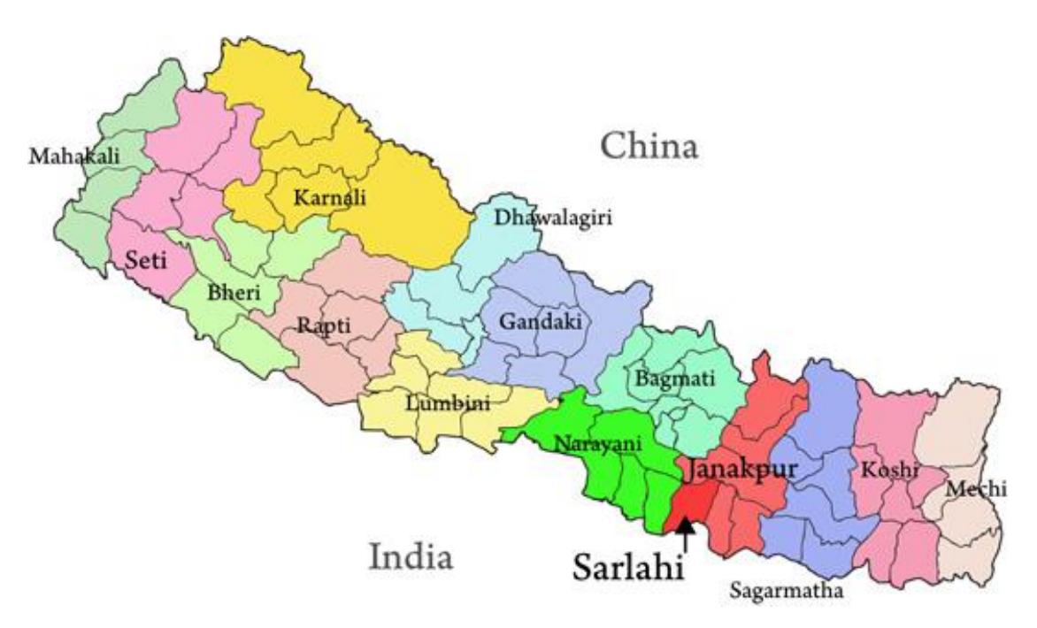
Figure 2: Map of Nepal showing Sarlahi District. (Google image) (Access on :09/08/14)

Jabdi is a Village Development committee (VDC) in Sarlahi district in Janakpur zone. The zone lies under the central development region of Nepal. According to Central Bureau of Statistics report 2011, the total population of Jabdi district is 8771 among which 4146 are males and 4625 are females. It has 1808 households. (CBS, 2011) People in Jabdi, belongs to different castes. Most of them are Tharu, Bahuns, Chettri, Yadav, Mushar, teli. Particularly, in this VDC majority of the people are from Dalit (untouchables), Janajati (ethnic minorities) along with high caste (Brahmin, Chettri,). Almost all people respect and follow Hinduism and likewise traditions with slight variation. Most of the people speak maithali a local language and among them 25 % are unfamiliar with the Nepali language (UNDAF, 2013).