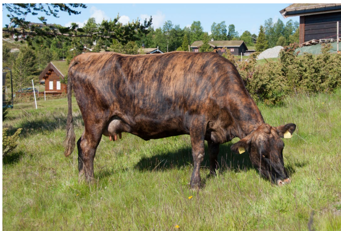
Figure 11. Døla Cattle.