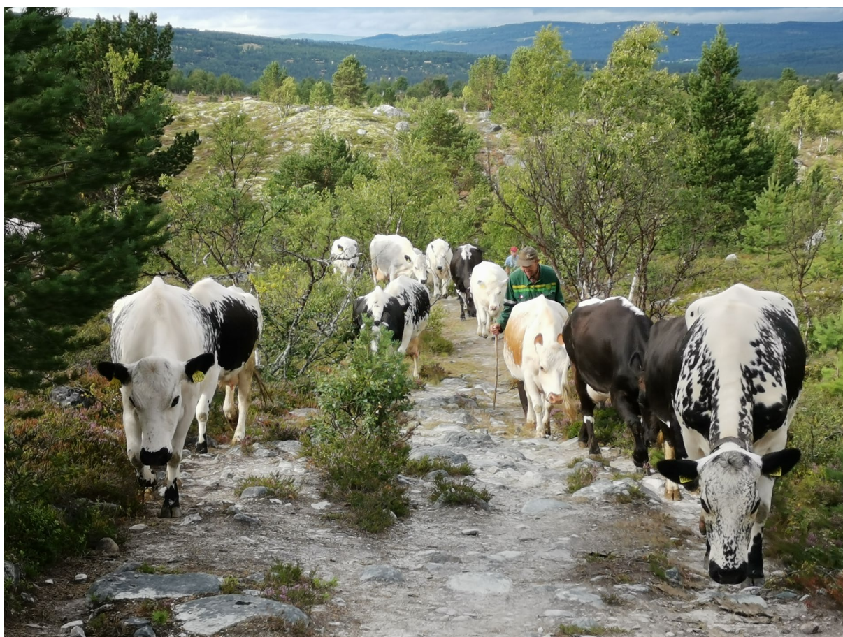
Figure 1. Sided Trønder and Nordland Cattle (STN) is the most numerous of Norway’s cattle breeds at risk, both in terms of number of breeding animals and effective population size. This STN herd, owned by R.P. Tørres, is seen grazing in the mountains near Røros in 2019.

The breeding programs’ primary goals have been to avoid a rapid increase of the inbreeding rate and to keep the effective population size as large as possible. Important measures included the avoidance of mating closely related animals, and the use of all heifers and as many bulls as possible in breeding. However, we have so far not had any tools for assessing the effects of such breeding strategies on achieving the breeding objectives. This report presents for the first time an analysis of inbreeding rate and effective population size for these breeds.