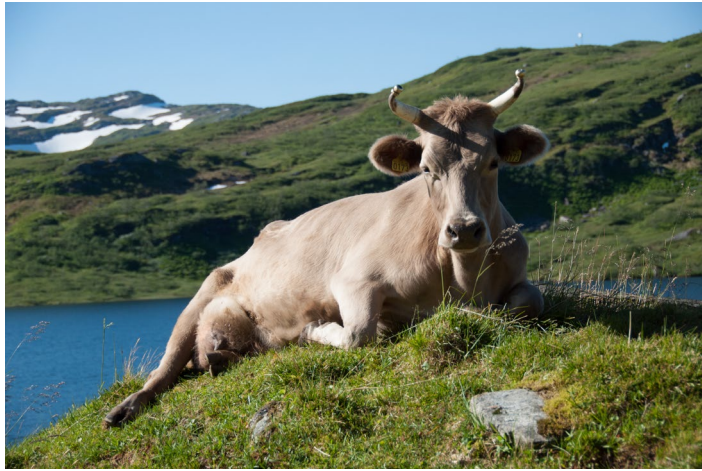
Figure 12. Western Fjord Cattle.

In 1990, there were only 49 Western Fjord Cattle breeding dams. Since then, the number of breeding dams has grown considerably and steadily, see Figure 2. Between 2010 and 2020, the breeding dam population has more than doubled, from 426 to 1018, respectively. One would expect that such a rapid population growth would be accompanied by a greater increase of the inbreeding rate than desired. However, the results show that the farmers keeping the breed made the right decisions on their breeding strategy.