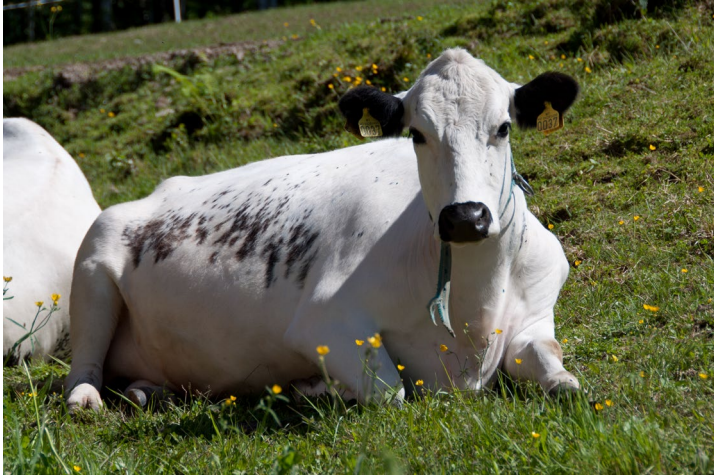
Figure 7. Sided Trønder and Nordland Cattle (STN).

Although we do not have precise historical data on the number of breeding dams of Sided Trønder and Nordland Cattle (STN), it is reasonable to assume that the population of this breed never was as small as that of the other breeds at risk. We estimate that there were about 300 breeding dams 5 in the 1970s,