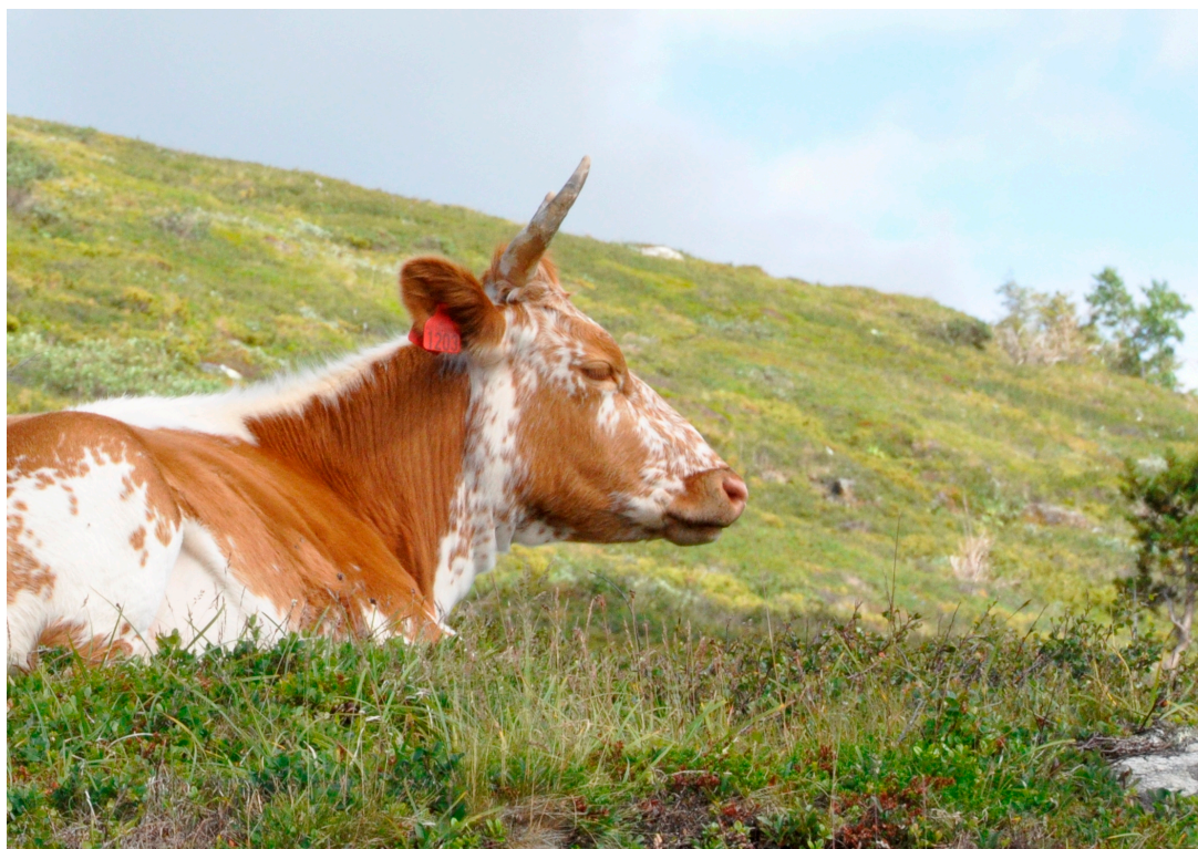
Figure 13. The success of the breeding programs for the Norwegian cattle breeds at risk should not be taken for granted. We have to continue to work hard, and not rest on our laurels – like this Telemark Cattle heifer seems to be doing on a mountain pasture in the summer of 2017.

To gain a better understanding of these results, the use of breeding sires needs to be further analysed. For example, studying the number of breeding sires and the number of offspring per sire could help to explain how it was possible to keep the inbreeding rates of these breeds within the recommended level. Another topic for further investigation is relatedness between sires.