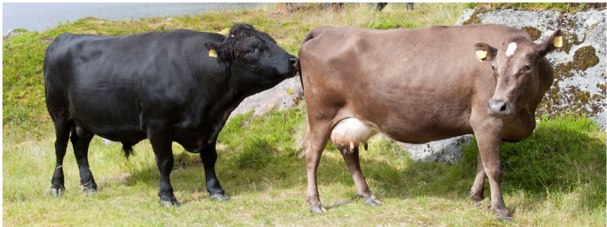
Figure 3. Having a large number of breeding sires in small, endangered populations is essential. This can be achieved by using herd bulls, like this Fjord Cattle bull on a mountain pasture in western Norway.

More simplified one can say that effective population size is a measure for the number of unrelated individuals that contribute genetically to the next generation. It is calculated on the basis of the inbreeding rate of the population. To be genetically sustainable, N_e should be larger than 50, and preferably above 100.