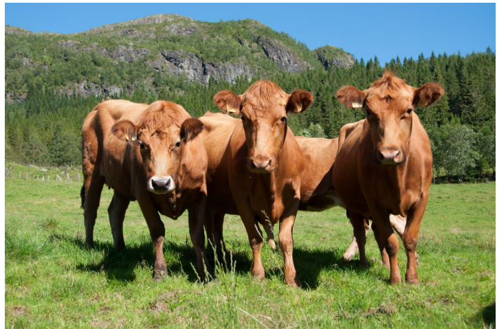
Figure 10. Western Red Polled Cattle.

Døla Cattle and Western Red Polled Cattle have in common that their populations are very small and the number of breeding dams is only increasing slowly, see Figure 2. Both breeds have managed to keep the inbreeding rate at an acceptable level. As a result, the effective population size ( N_e ) has shown a positive development, with both breeds having reached N_e values of above 50 in the last decade. The breeding strategy for these two breeds can thus be considered sustainable, in terms of maintaining their genetic variation. During the past five years, the number of breeding dams has increased substantially. Although this increase did not occur as fast as in Eastern Red Polled Cattle, farmers keeping these breeds must nonetheless also make sure to use a sufficient number of breeding sires to keep the inbreeding rate within the recommended limits.