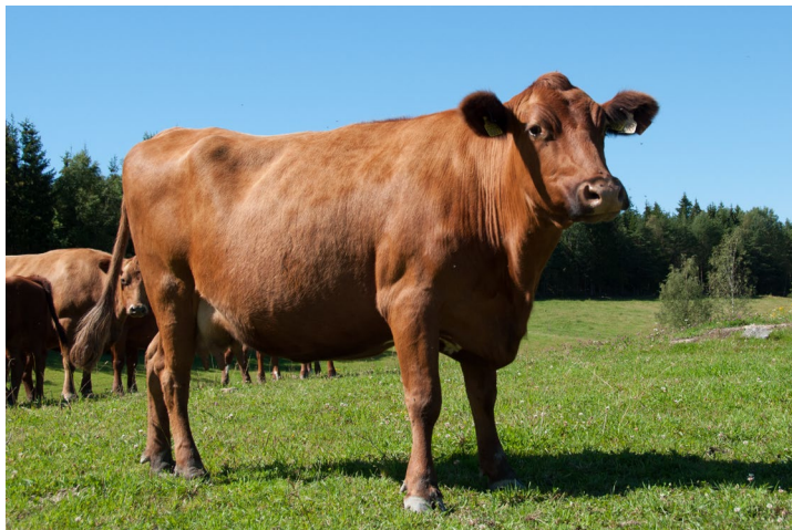
Figure 8. Eastern Red Polled Cattle.

Eastern Red Polled Cattle was by far the least numerous breed in 1990. At that time, its population consisted of only 11 purebred breeding dams and about 10 AI bulls, which were born in the 1980s and had been accepted for semen collection by Geno. The population increased and was saved from extinction by pure-breeding the eleven remaining dams, and in addition, a number of farmers