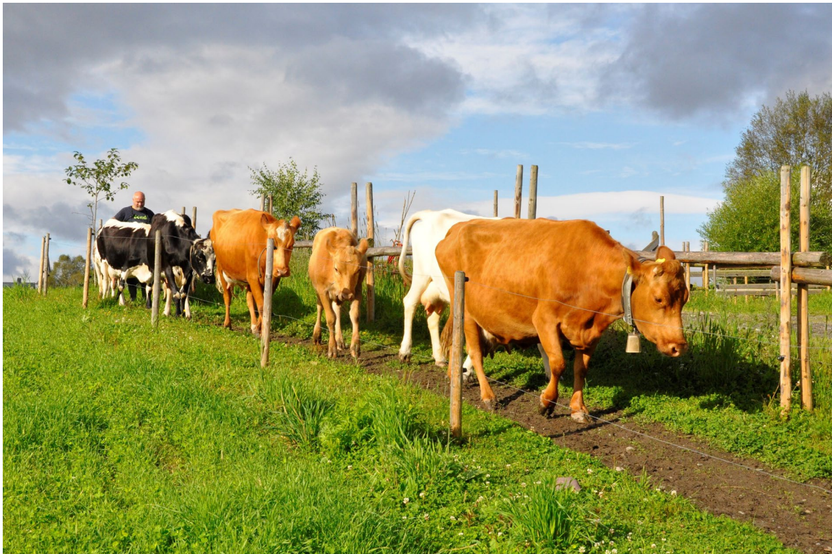
Figure 4. Western Red Polled Cattle, Western Fjord Cattle and STN cows heading home to be milked. Fannrem Farm, 2017.

The individuals with a sufficient amount of pedigree data were divided into three groups according to birth year (1991-2000, 2001-2010, 2011-2020). This was done to show trends over time.