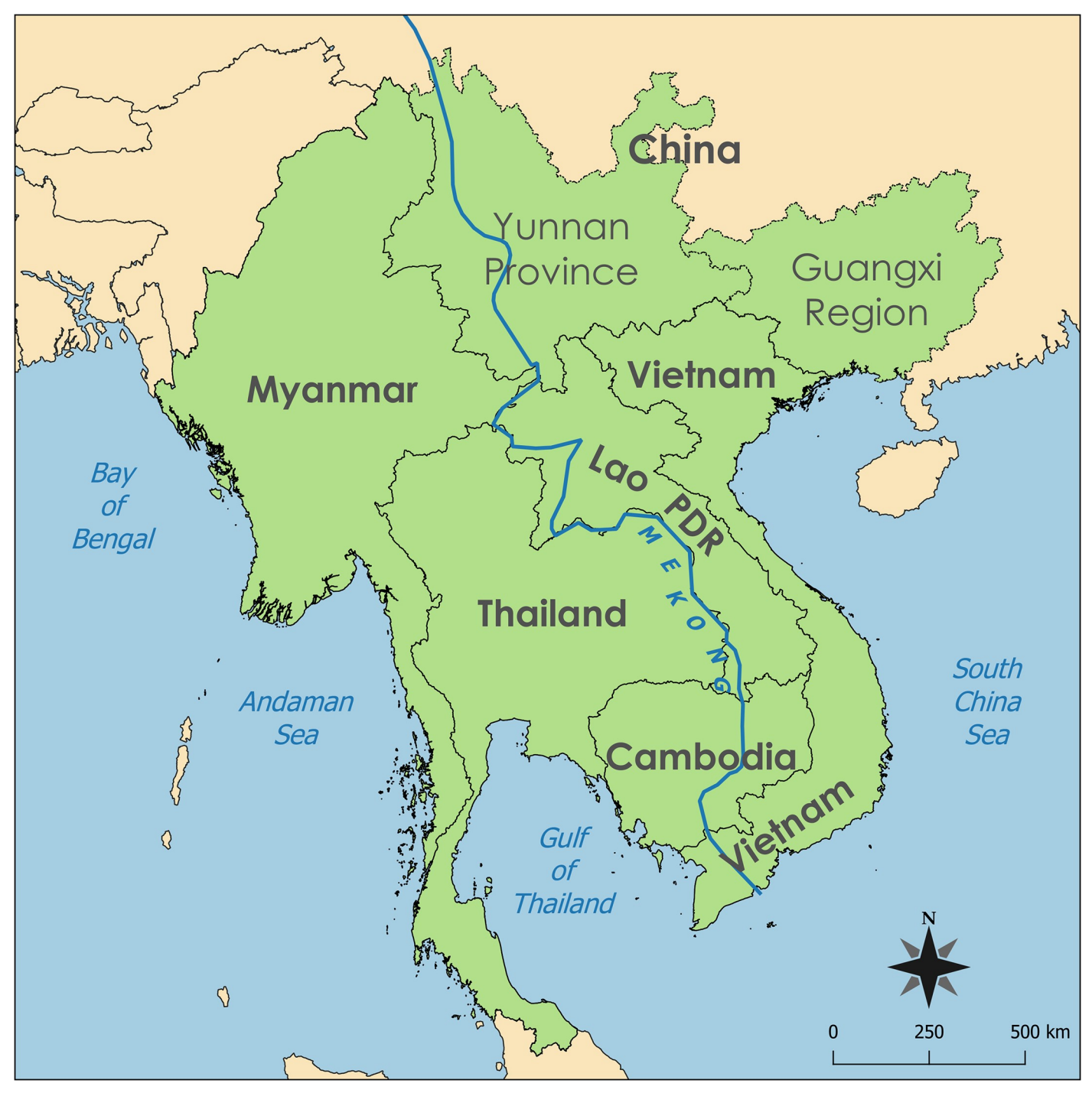
Fig 1. GMS. The map was made using QGIS version 3.4 (https://qgis.org). All map layers were created by one of the coauthors.

https://doi.org/10.1371/journal.pntd.0008302.g001