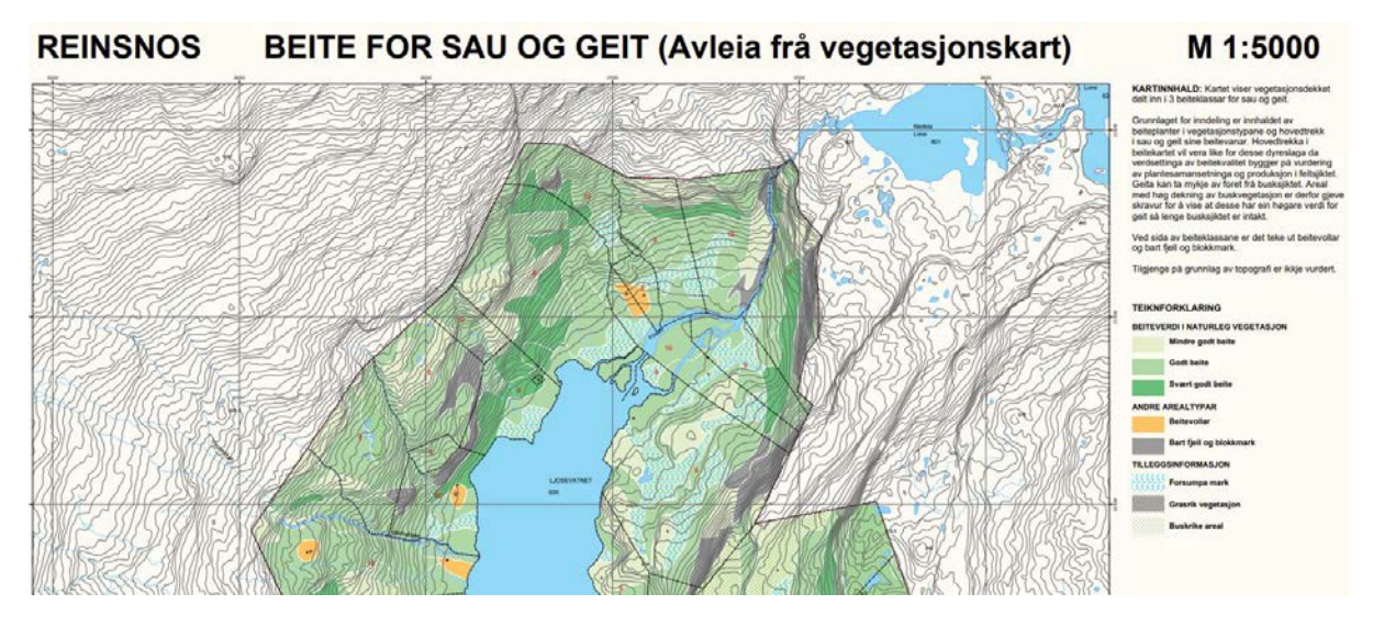
Figure 1: Section of grazingmap (sheep and goat) derived for a vegetation map of Reinsnos used in a case heard at Hardanger land consolidation court (Rekdal 2000).

Kilden, the Norwegian Institute of Bioeconomy Research's main map portal<sup>22</sup>, provides information about where vegetation maps are available. These vegetation maps are split into two categories: maps available on Kilden and maps available on paper. Only a few areas have vegetation maps available, and it is down to luck whether one is available for an area where land consolidation is requested.