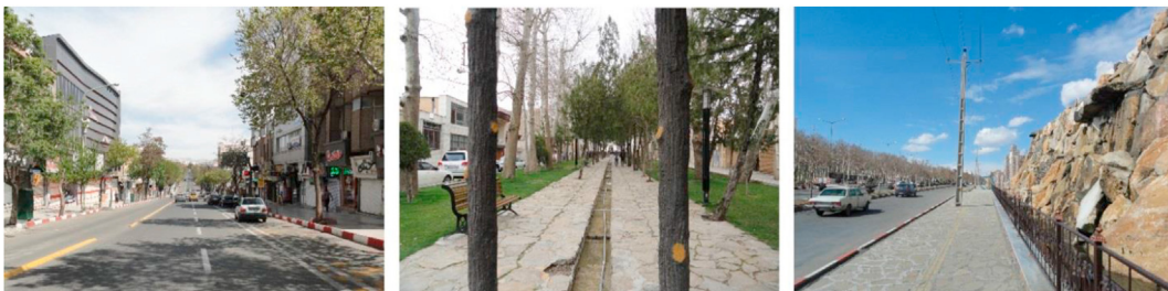
Figure 4. Samples of continuous view.