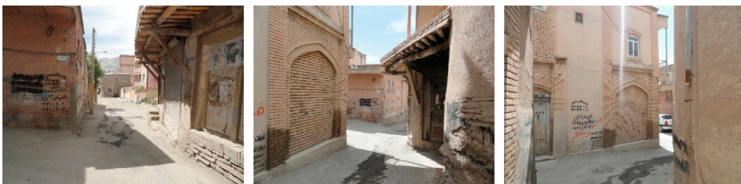
Figure 6. Samples of serial view.