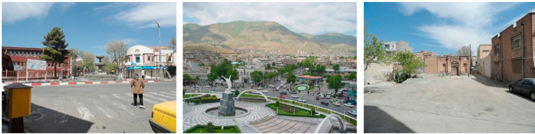
Figure 2. Samples of Focal View (space oriented).