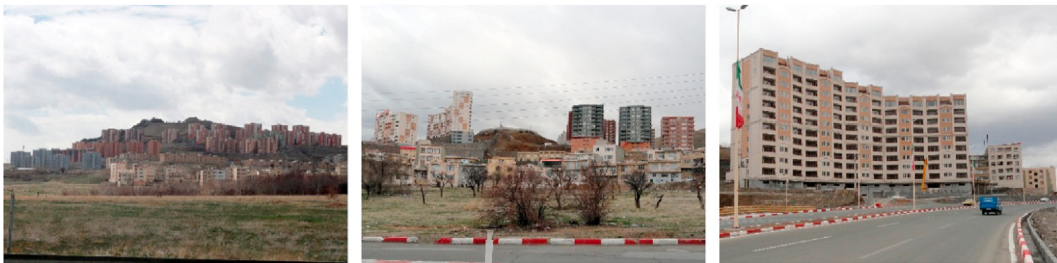
Figure 8. Samples of Façade and Skyline view.