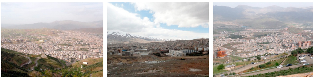
Figure 11. Samples of panoramic view.