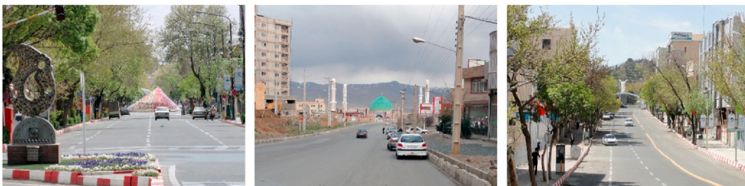
Figure 5. Samples of axial view.