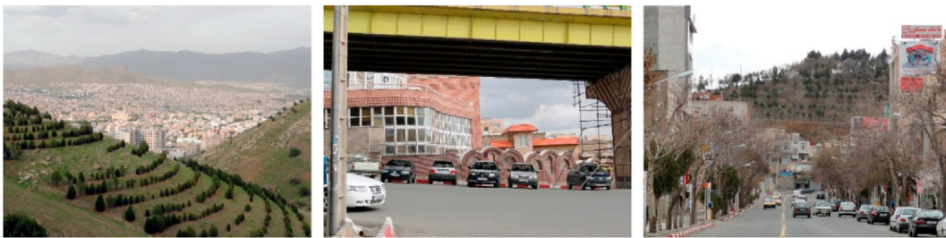
Figure 9. Samples of framed view.