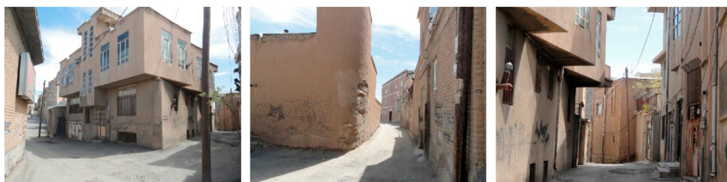
Figure 12. Samples of perspective view.