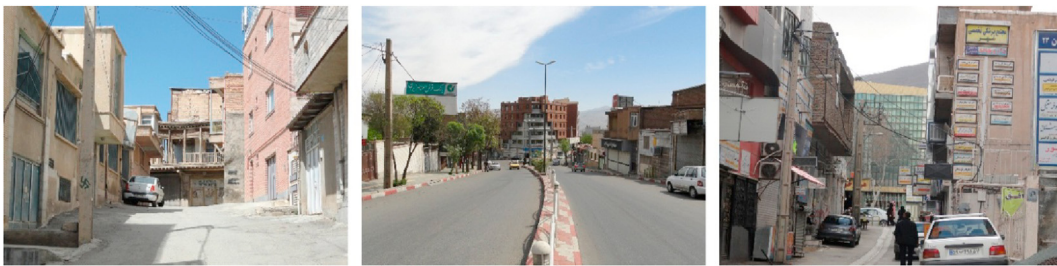
Figure 10. Samples of blocked view.