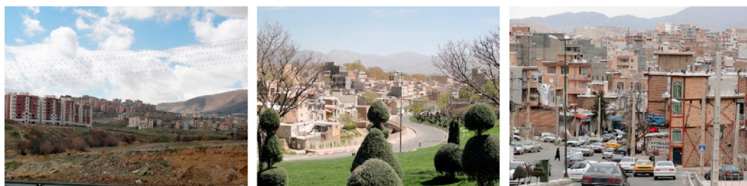
Figure 13. Samples of layered view.

were extracted. These terms were the same as “open coding” that were conceptualized and regulated by the researchers (Tables 1 and 2 3, 4, 5). The points that were extracted in the interviews with the citizens of Sanandaj as open codes were very useful in this context. For example, in an interview, one of the citizens stated: “... when I pass the main and important streets such as Ferdowsi Street and Imam Street, I see different traffic signs, advertising panels and trees that do not allow me to see the building facades. It is very disordered. I do not remember the architecture and the facade of the street, but the totality of the street, its slope and shops are memorable”. Another citizen explained, “My path to the office (Feizabad Street) is disgusting... it has nothing remarkable look to at”. In another interview someone said, “In my opinion, the most beautiful street in Sanandaj is Ostandari Street because there are tall trees along the street, which are homes to sparrows”.