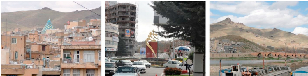
Figure 3. Samples of sign and landmark view.