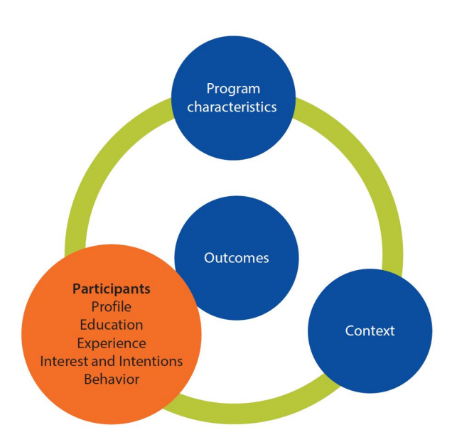
FIGURE 7: PARTICIPANT CHARACTERISTICS

Obtained from: «Entrepreneurship Education and Training Around the World: Dimensions of Success» by Valero, Parton & Robb, (2014). The World Bank.