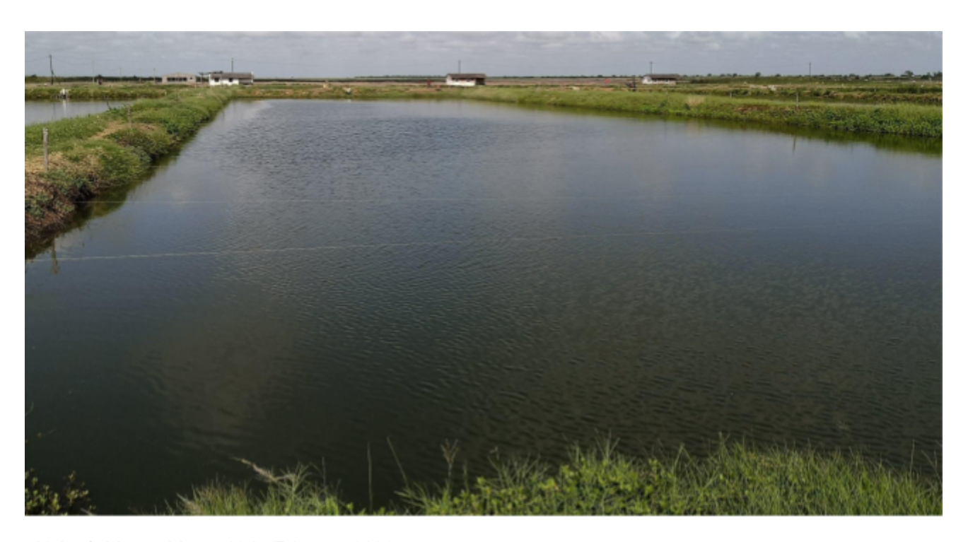
FIGURE: 1. A POND AT PAPA PESCÁ

The program involves both practical training and theoretical classes. The aim of the practical activities is to give understanding of how aquaculture works in practice. The practical part involves activities like; preparing and disinfecting the ponds, feed of the fish, measure water quality, estimate body mass of the fish by making samples, maintain ponds during the cycle, cut the grass, look after predators, harvest and sell the fish.