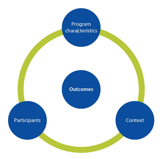
FIGURE 4: CONCEPTUAL FRAMEWORK

In order to better understand the reasons why the participants do not start independent businesses after ending the training program we need to take a closer look at the variables that affect outcomes of such programs. A framework developed by Valerio, Parton and Robb (2014) outlines the main factors that affect the outcomes of education and training programs. The framework has been used in several comprehensive studies on entrepreneurship and training programs and is therefore arguably well suited for analyzing the program at Papa Pesca. The framework explain that there are three main factors, or dimensions, that have an impact on the outcome of EET programs. The three dimensions are the program characteristics, the participants and the context.