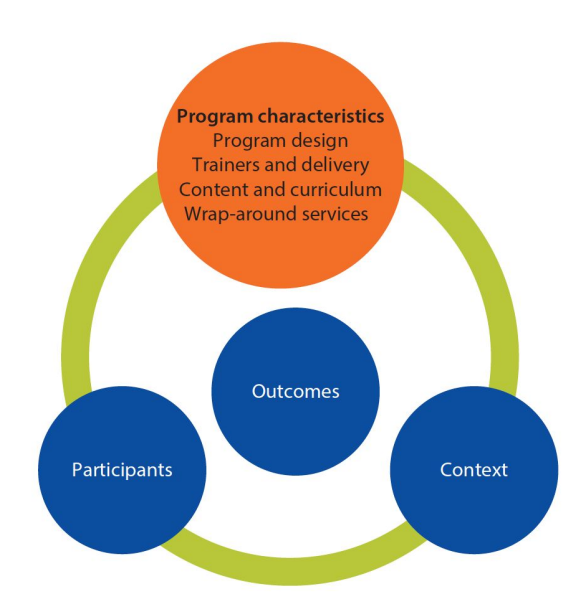
FIGURE 6: PROGRAM CHARACTERISTICS