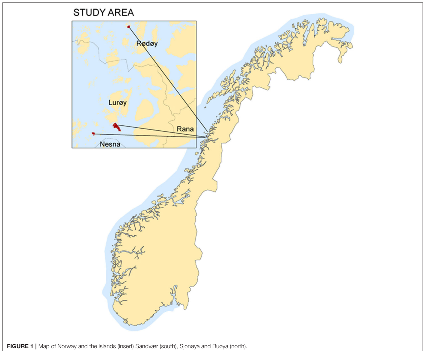
FIGURE 1 | Map of Norway and the islands (insert) Sandvær (south), Sjonøya and Buøya (north).

The study was performed at commercial farms and the only extra handling of animals was through weighing. The animals were collected by help of sheep dogs per normal practice at the farms. We followed the regulation for use of animals in experiments,