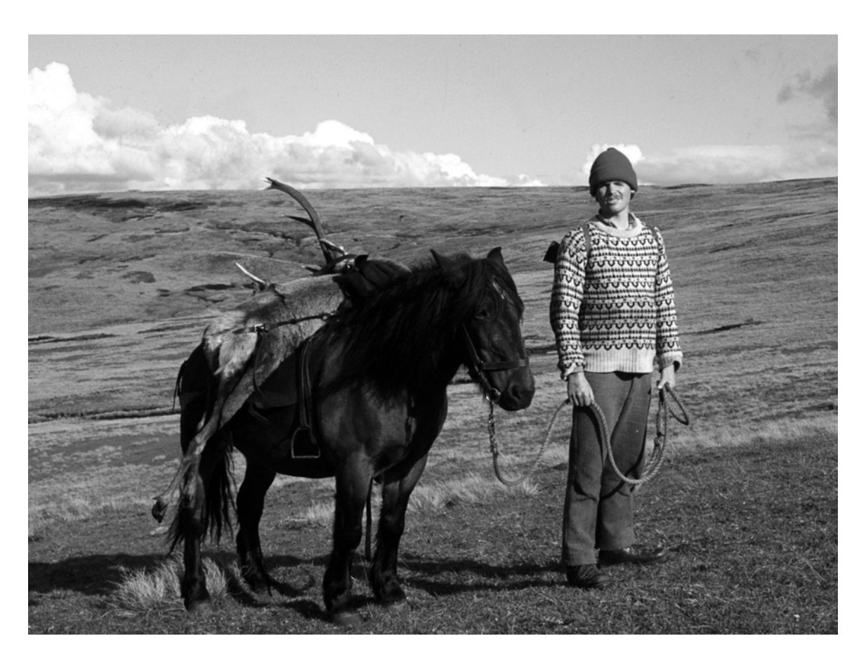
The Author Working on a Hunting Estate in his Youth

The growth in sporting estates, for example, led to specialised cultural inventions such as estate tartans or tweeds. The wealthy nouveau riche tenants and landowners were keen to mimic perceived indigenous customs and, in an attempt to appropriate the traditions of clan chiefs who supplied their retainers with clan tartan, they had tweeds specially designed for use by themselves and their staff, a practice that continues today (Harrison, 1995).