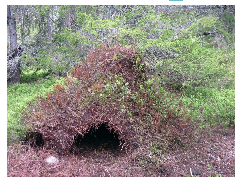
FIGURE 1 A winter den of a brown bear excavated in an abandoned anthill in Sweden

In addition to the attributes of excavated dens, several other factors may affect the prehibernation body condition and energy loss of bears during hibernation. Loss of body heat during hibernation can be exacerbated by severe winter temperatures (Tøien, Blake, & Barnes, 2015), even if the animal is hibernating in an enclosed cavity (Thorkelson and Maxwell 1974). The amount of snow may positively affect energy conservation during hibernation by enhancing insulation (Beecham et al., 1983; Servheen & Klaver, 1983; Sorum et al., 2019; Vroom et al., 1980; Wathen, Johnson, & Pelton, 1986). Energy loss and body mass in bears during hibernation are highly affected by prehibernation body condition (Atkinson & Ramsay, 1995; López-Alfaro, Robbins, Zedrosser, & Nielsen, 2013; Zedrosser, Dahle, & Swenson, 2006). Larger bears potentially gain more fat and lean mass prior to denning (Manchi & Swenson, 2005), considering the positive correlation between body size and body mass (Dahle, Zedrosser, & Swenson, 2006), and thus, males and older bears are assumed to be in a more favorable condition at the onset of hibernation, due to their larger body size (Hilderbrand et al., 1999; Swenson, Adamič, Huber, & Stokke, 2007). Energetic costs and weight loss in bears increase with the duration of hibernation (López-Alfaro et al., 2013), and the duration of denning is sex-dependent (Friebe et al., 2001; Manchi & Swenson, 2005; Pigeon, Stenhouse, & Côté, 2016).