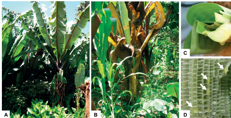
FIGURE 1 | Enset plantation showing symptoms of bacterial wilt disease. (A) Healthy plant; (B) enset plant showing symptoms of bacterial wilt disease; (C) cross-sectional cut of infected leaf released yellowish ooze; and (D) pockets of bacteria ooze appeared in an opened leaf sheath (arrow).

These bacterial wilt disease symptoms and signs are useful to identify the disease at the farm level.