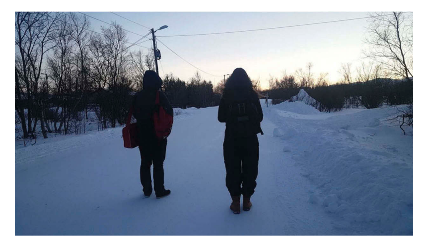
Figure 6. Together with friends – home from school.

The most important part of going to school is that there is a higher education in the other end of it. I could end up with the education that I am really interested in. If I get good grades I will be able to enter the study program I really want to be part of ... and then I will have the life I want in a sense.