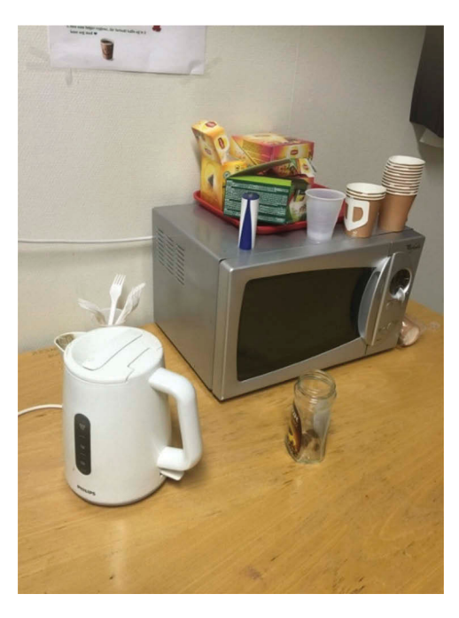
Figure 4. The tea corner.

conversations. The students described the importance of a balance between school and time off, and their need for breaks both in and outside of school. According to Anna: "You need breaks during the day at school to get you through the day". During the breaks, the students would spend their time informally socialising with other students, often in connection with eating or drinking. A kettle and a coffee machine were available in a small corner of a room for student use, which they called the "tea corner" (Figure 4) and highlighted as an important gathering place. During ordinary school days, students could look forward to breaks outside of school, which were regarded as rewards and opportunities to reconstruct individual integrity and express identity (Figure 5).