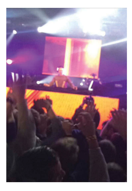
Figure 5. From a concert. An example of outside of school recuperation.

Figure 6 illustrates the significance of the school as an arena for making friendships, as expressed Kari: