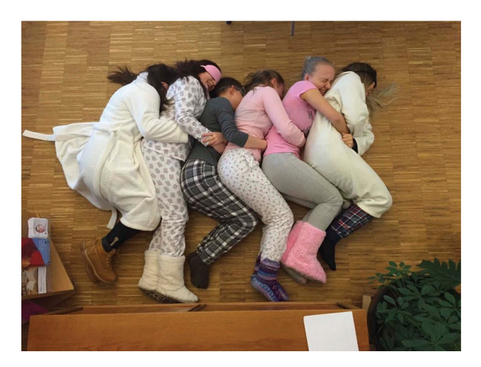
Figure 2. From a pyjamas-day.

Here we had a theme-day with the final-year students. It was pyjamas-day, and that was a very good theme. And then it's really cozy that all the final-year students come together, and then we take pictures of each other. These are events to look forward to if daily life at school is a bit boring.