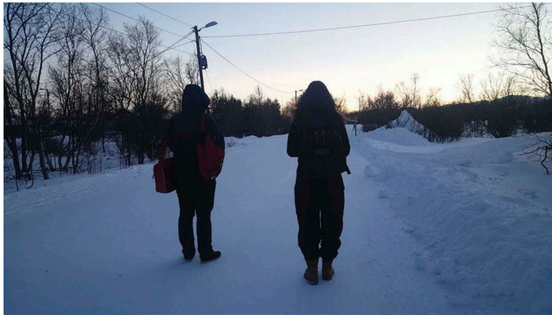
Figure 6. Together with friends – home from school.

The most important part of going to school is that there is a higher education in the other end of it. I could end up with the education that I am really interested in. If I get good grades I will be able to enter the study program I really want to be part of ... and then I will have the life I want in a sense.