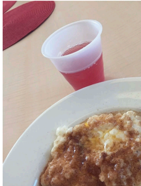
Figure 3. Free porridge for lunch once a week.