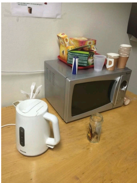
Figure 4. The tea corner.

conversations. The students described the importance of a balance between school and time off, and their need for breaks both in and outside of school. According to Anna: “You need breaks during the day at school to get you through the day”. During the breaks, the students would spend their time informally socialising with other students, often in connection with eating or drinking. A kettle and a coffee machine were available in a small corner of a room for student use, which they called the “tea corner” (Figure 4) and highlighted as an important gathering place. During ordinary school days, students could look forward to breaks outside of school, which were regarded as rewards and opportunities to reconstruct individual integrity and express identity (Figure 5).