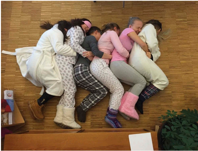
Figure 2. From a pyjamas-day.

Here we had a theme-day with the final-year students. It was pyjamas-day, and that was a very good theme. And then it's really cozy that all the final-year students come together, and then we take pictures of each other. These are events to look forward to if daily life at school is a bit boring.