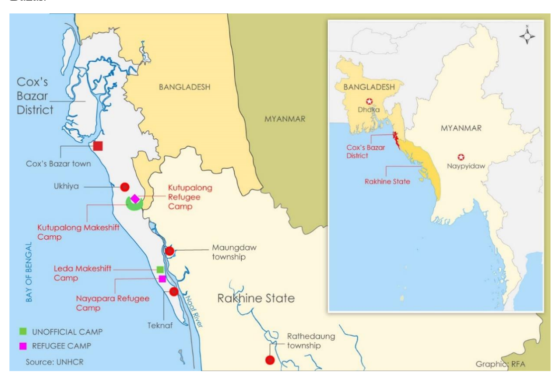
Figure 1: Map of Rohingya refugee camps of Bangladesh (Benar News, 2018)