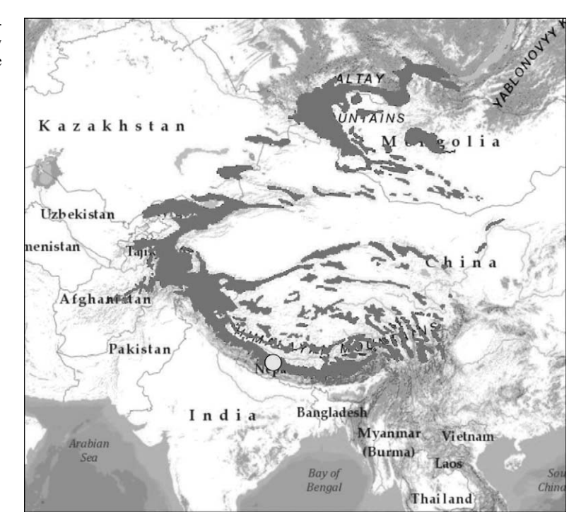
Figure 1. Global distribution of snow leopards, redrawn from Fox (1994). Our study area in Nepal is indicated by the circle displayed on the map.

natural prey, but like other large felids, it prefers larger ungulates because these confer most net energetic gain per unit effort expended. Thus, throughout its wide range, bharal (blue sheep/naur) Pseudois nayaur and Asiatic ibex Capra ibex constitute its preferred and stable, natural diet.