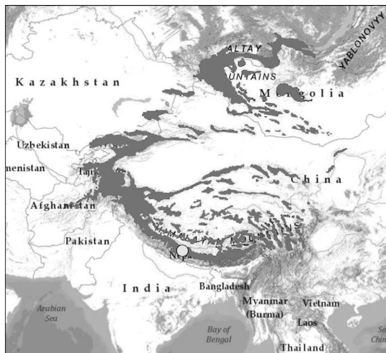
Figure 1. Global distribution of snow leopards, redrawn from Fox (1994). Our study area in Nepal is indicated by the circle displayed on the map.

natural prey, but like other large felids, it prefers larger ungulates because these confer most net energetic gain per unit effort expended. Thus, throughout its wide range, bharal (blue sheep/naur) Pseudois nayaur and Asiatic ibex Capra ibex constitute its preferred and stable, natural diet.