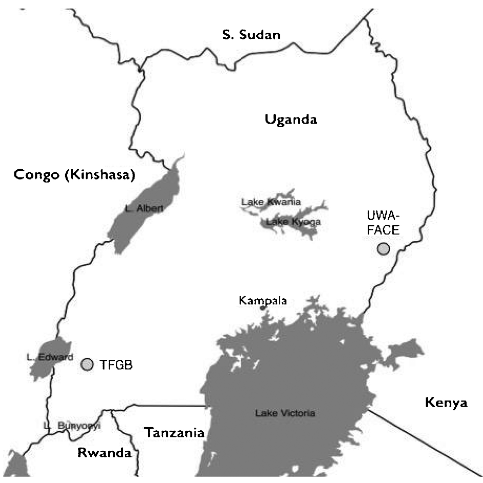
Fig. 2. Map of Uganda showing the approximate locations of the studied projects (TFGB and UWA-FACE).

of working with smallholders with little land (cf. Wunder, 2008). Participants are required to plant indigenous trees in woodlots or agroforestry systems and Eucalyptus species are excluded from Plan Vivo protocols. After planting, participants make a formal application and household members sign a contract with Ecotrust. The contract obliges participants to maintain their plantations for a period between 25 and 50 years (recent and initial contracts, respectively). In return they receive 60% of the carbon sales price (Ecotrust takes 40% for implementation (Ecotrust, 2009)), which is disbursed in five payments spread over the ten years following plantation establishment.