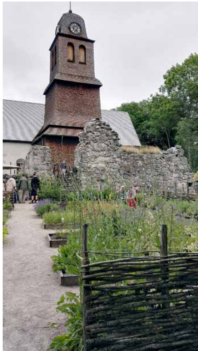
■ Nydala Klosterträdgård med ört- och kryddgårdens upphöjda växtbäddar och flätstaket av lokalt plockad hassel från medeltidsdagen den 29 juli 2017. I bakgrunden kyrkans västtorn och resterna av den medeltida klosterkyrkans västfasad.

Ramarna som sattes under projektet, med utformningsprinciper från St. Gall samt konstruktion och växtinnehåll med utgångspunkt i historiska och arkeologiska källor, har visat sig vara både en utmaning och en drivkraft för fortsatt arbete. Växtematerialet som