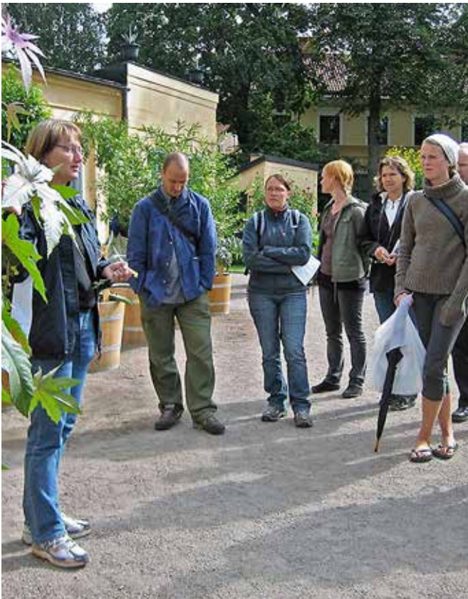
■ Nätverket för trädgårdshistoriska praktiker bildades 2006 och träffades två gånger per år. Vi visade våra arbetsplatser och diskuterade det mesta som berör en historisk anläggning idag. Bilden är från en träff i Linnéträdgården i Uppsala, 2007.