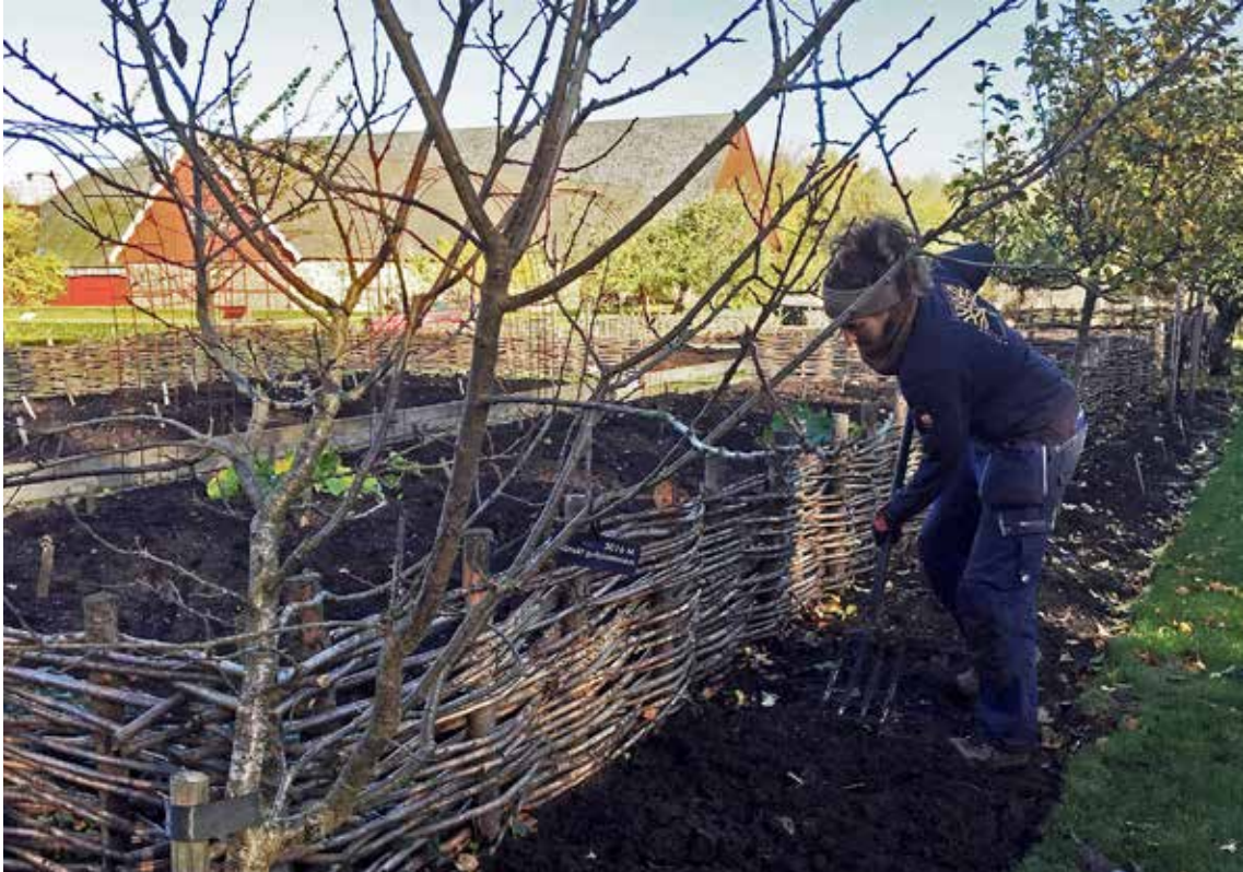
■ A conclusion of the seminar was that research and practice in open-air museums must go hand in hand. One example of this is to research old cultivation methods as well as practicing them, which is done at Fredriksdal museums and gardens. The speakers pointed out the importance of making people aware of history and the multifaceted pedagogical aspects of the gardens, such as displaying the historical plants and their stories, as well as displaying the practical work. (Photo: Anna Jakobsson, Oct 2016)