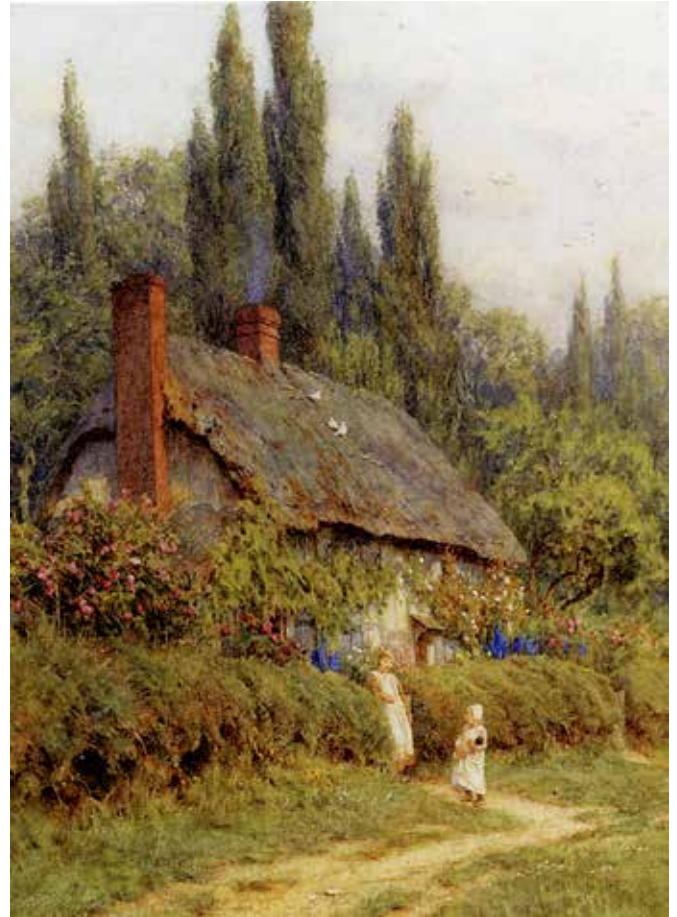
■ Fig. 3. A cottage in West Horsley, Surrey, in a painting by Helen Allingham, c1890. ( https://commons.wikimedia.org/wiki/File:Allingham_Helen_Children_On_A_Path_Outside_A_Thatched_Cottage_West_Horsley_Surrey.jpg )

Surrey History Centre, 5420/2/5 (Ashted Parish Magazine, September 1899).