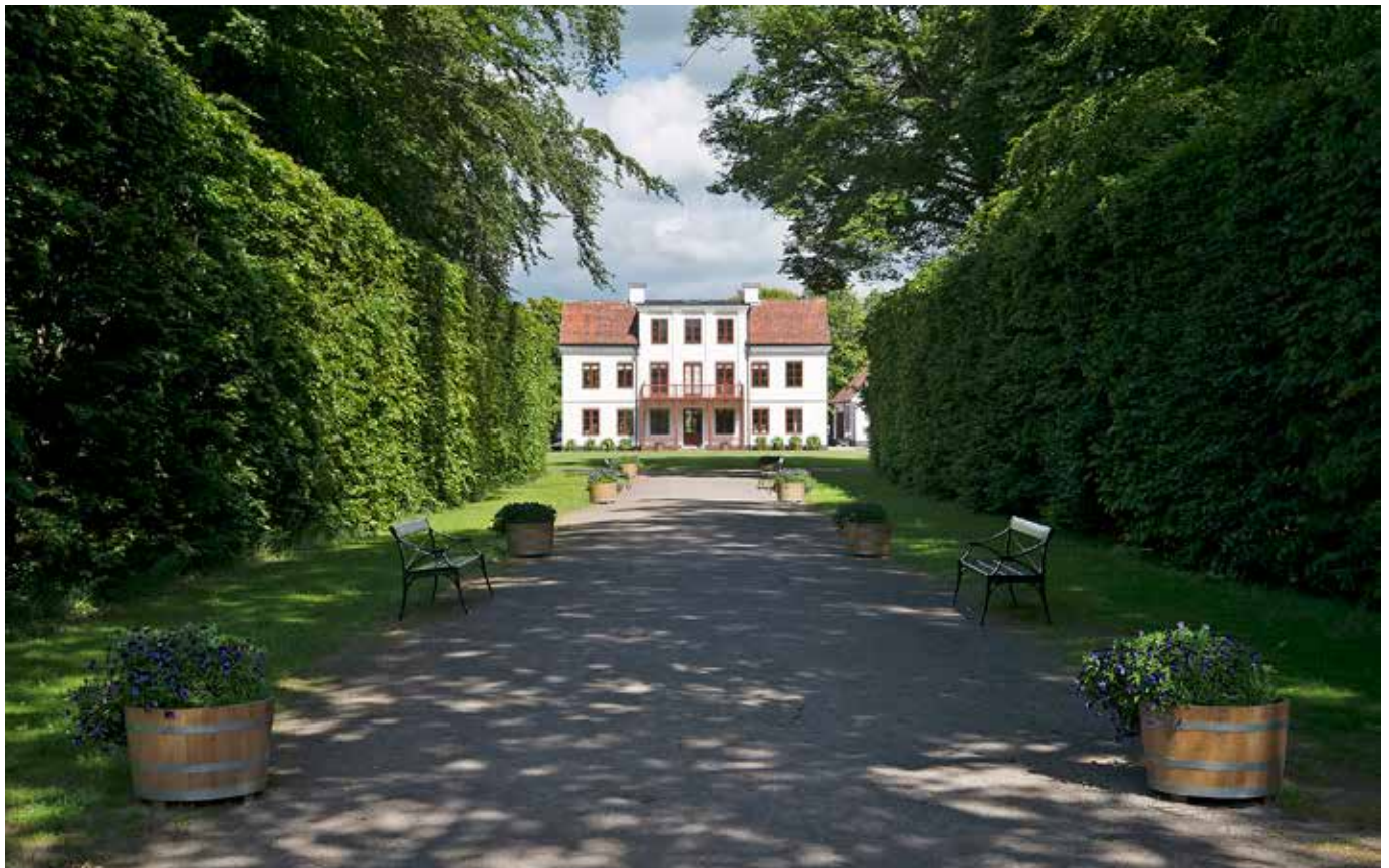
■ Fig. 1. The manor house of Fredriksdal built in 1787 by Fredrik Wilhelm Cöster, Director of Diving Operations.

Fredriksdal is one of the landmarks of the City of Helsingborg – an oasis for local people and an attraction for visitors. It is an open-air museum covering 36 hectares, built up around an 18 th -century manor house and stables. The historic gardens, established in accordance with contemporary European ideals, still remains and is managed with the vision “grow and show”.