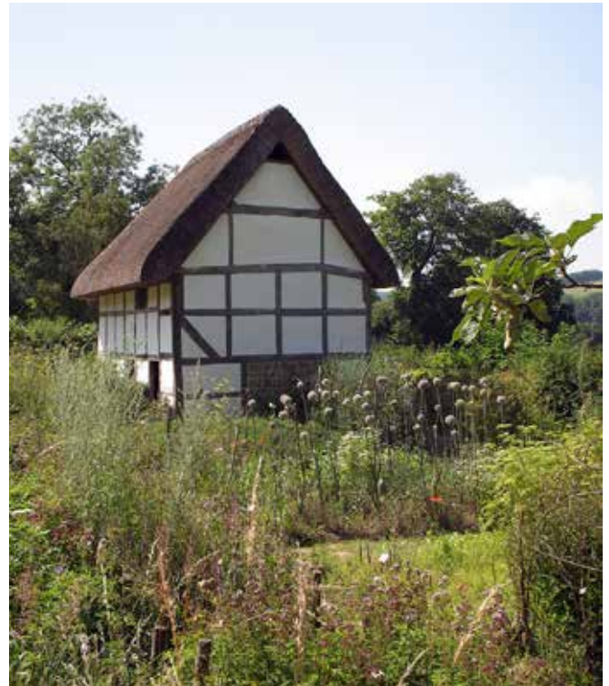
■ Fig. 1. Poplar Cottage, c1630-1650.

The term 'common land' refers to the non-arable and unenclosed areas of land on a manor, which might include commons, roadside verges and sometimes woods and pastures. It was owned by the lord of the manor, but the tenants had the right to a share of its natural products and to pasture their animals. In 1589, in response to a rapid increase in the construction of 'wasteland' cottages, an act was passed which made it illegal to build a cottage without four acres of land. Those who did so might find themselves prosecuted in the local