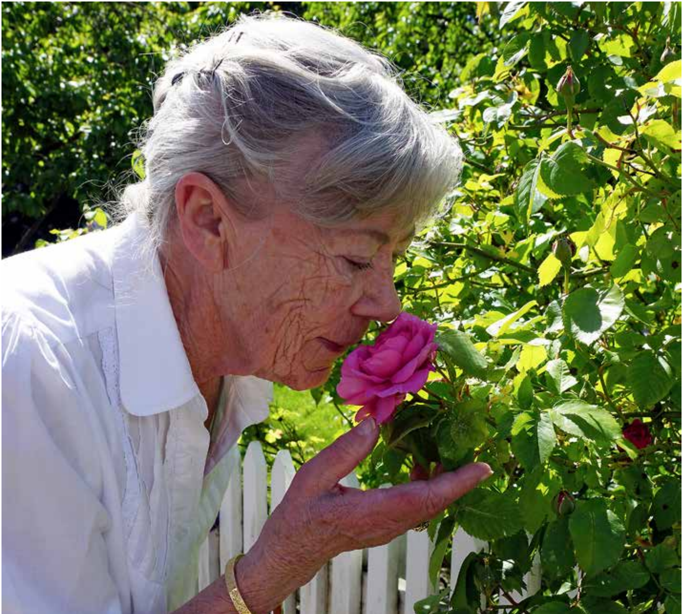
■ Fig. 4. Smell is a very important sense for time travelling. (Photo: Kamma Mogensen, Den Gamle By, 2016)

In 2015, we started using the garden path and the garden next to Lemvighuset, in programs for people suffering from dementia. As the other programs of this sort in Den Gamle By, the memories of our elderly guests are the most important part of it (Hyman, 2016). Being in the garden makes them remember more of their past. All senses are triggered: smell, taste, sight and hearing (see Fig. 4). As part of the programs, the museum hosts serve coffee in the garden with cakes made from historical recipes. An accordion player plays music and the participants sing or dance. Finally, most importantly, they plant cuttings in flower pots to take back to the nursing home or to their own home, as a way of trying to trigger memories in the days to come.