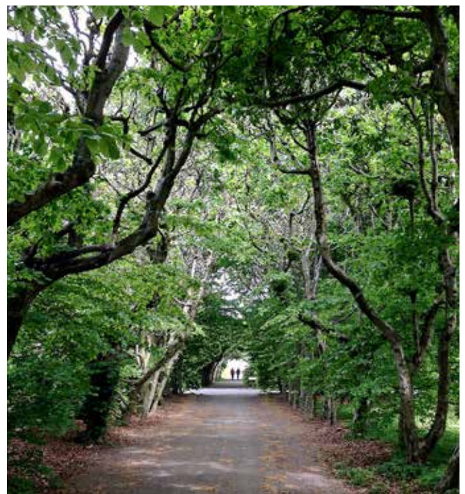
■ Fig. 2. The hornbeam hedges of today. This is probably the oldest plant material you will find at Fredriksdal, remaining from the original garden in 1787. (Photo: Anna Bank, 2015)

The last private owner of Fredriksdal, Gisela Trapp, shared an interest for cultural history with her much older husband Oskar. He passed away in 1916 and just two years later, Gisela donated Fredriksdal to the City of Helsingborg, for it to become an open air museum and a botanical garden – a place for everyone to learn from, and enjoy. Thanks to Gisela Trapp’s detailed instructions Fredriksdal exists in its current unaltered state. The conditions in the donation letter are clear and to the point: The estate’s buildings, gardens