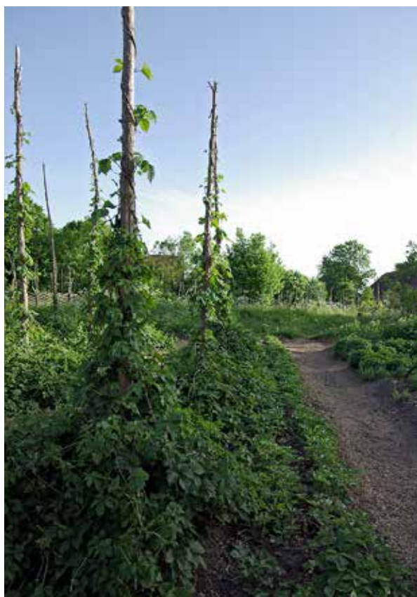
■ Humle på Linnés Råshult. (Foto: Inger Olausson, maj 2008)