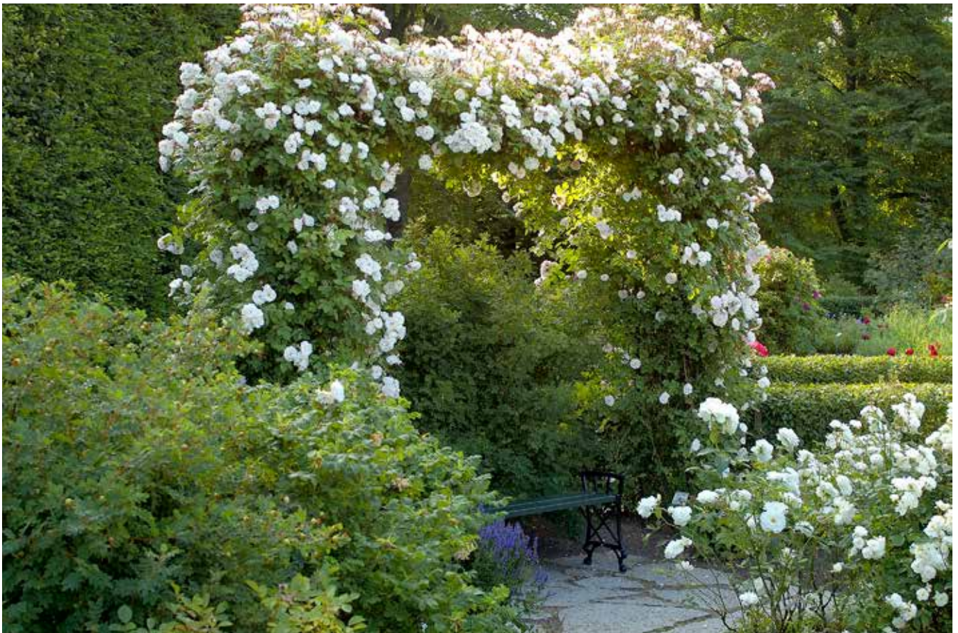
■ Fig. 3. Fredriksdal's rose garden contains a collection of 400 different species, hybrids and varieties of roses, mostly old fashioned roses. (Photo: Eddie Granlund, 2005)

Just at the entrance to Fredriksdal you find the rose garden, with a collection of 400 different species, hybrids and varieties of roses, mostly old fashioned roses, improved before 1920 (see Fig. 3). We preserve the roses that are worth cultivating because of their hardiness and pathogenic resistance as well as the roses that illustrate the history of rose-growing. The work with the rose collection at Fredriksdal started around 1980 when the former manager realized that the old fashioned roses were about to disappear and difficult to find in the market. Every nursery had the same variety of modern roses, without the smell and dependent on lots of nutrition, herbicides and pesticides in contrast to the old fashioned roses. Those