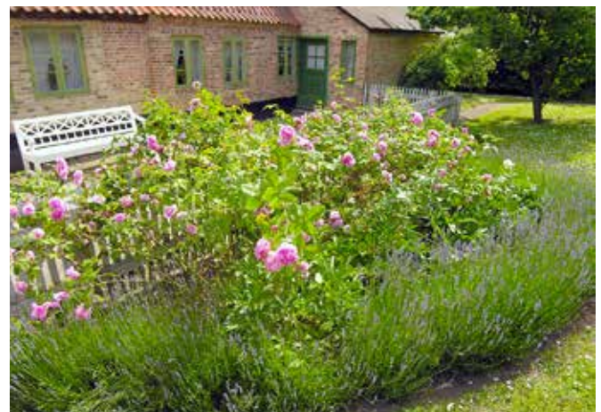
■ Fig. 3. The narrow yard with cobblestones at the house from Lemvig was divided from the garden with a wooden fence. At one of the house's sides, and by the wooden fence, a semicircular rose bed with borders of lavender was established in the 1990s, and fruit trees were planted in the lawn.

In 1980, Birgitte Kjær and others documented the garden, which had been established in 1919 because the previous garden burned down due to a fire in a neighboring timber yard (Kjær et. al. 1992). In the 1990s Birgitte Kjær and Gitte Røn used this documentation and family photos to establish a garden with the same elements as the original garden even if the space had a different shape (see Fig. 3).