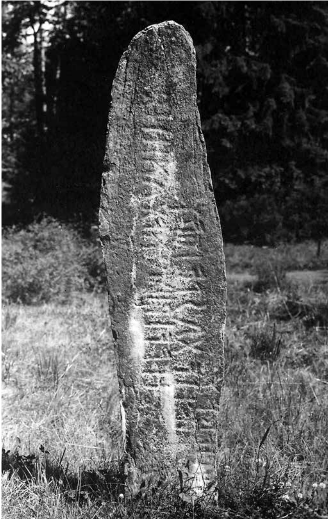
■ Fig. 2. The rune stone, made in concrete, by the firm Guidotti in 1885. An earlier cast model of the old Kjølevik Runestone made to British Museum was used to the new concrete cast, due to lack of an authentic rune stone. The fake rune stone was demolished in 1950s due to 'age'.