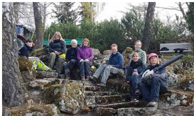
■ Studenter og faglærer fra Historiske grøntanlegg på Veia – Norges grønne fagskole, i nyrestaurert fjellhage fra 1930-tallet.

Studentene jobber mye ute i felt med praktiske, tverrfaglige prosjekter, og med problemstillinger mest mulig likt det de har på egen