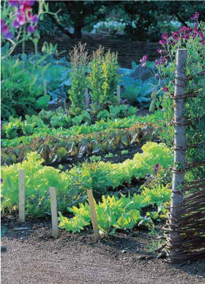
■ Fig. 4. In the kitchen garden we grow many varieties of different fruits and vegetables.

insights were the starting point of the investigation and collection at Fredriksdal that is now a hot spot during the middle of June until the end of July.