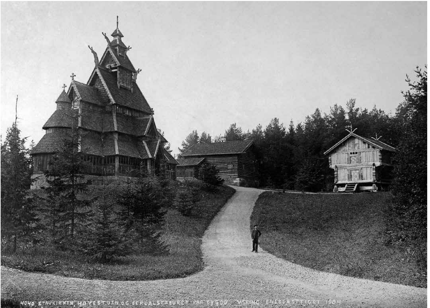
■ Fig. 3. King Oscar II's collection in 1904, with the stave church, Hove house and Berdal loft. The landscaping of the grounds gave impression of remoteness, thus being part of a public park relatively close to Oslo city.