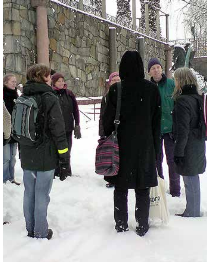
■ En träff på Millesgården, vintern 2009.

År 2006 startade Nätverket för trädgårdshistoriska praktiker i Sverige, ett informellt nätverk för de som arbetade i historiska trädgårdsmiljöer. Detta nätverk har sedan 2011 uppgått i nätverket Trädgårdsmästare i historisk miljö som Hantverkslaboratoriet i Mariestad tog initiativ till samma år.