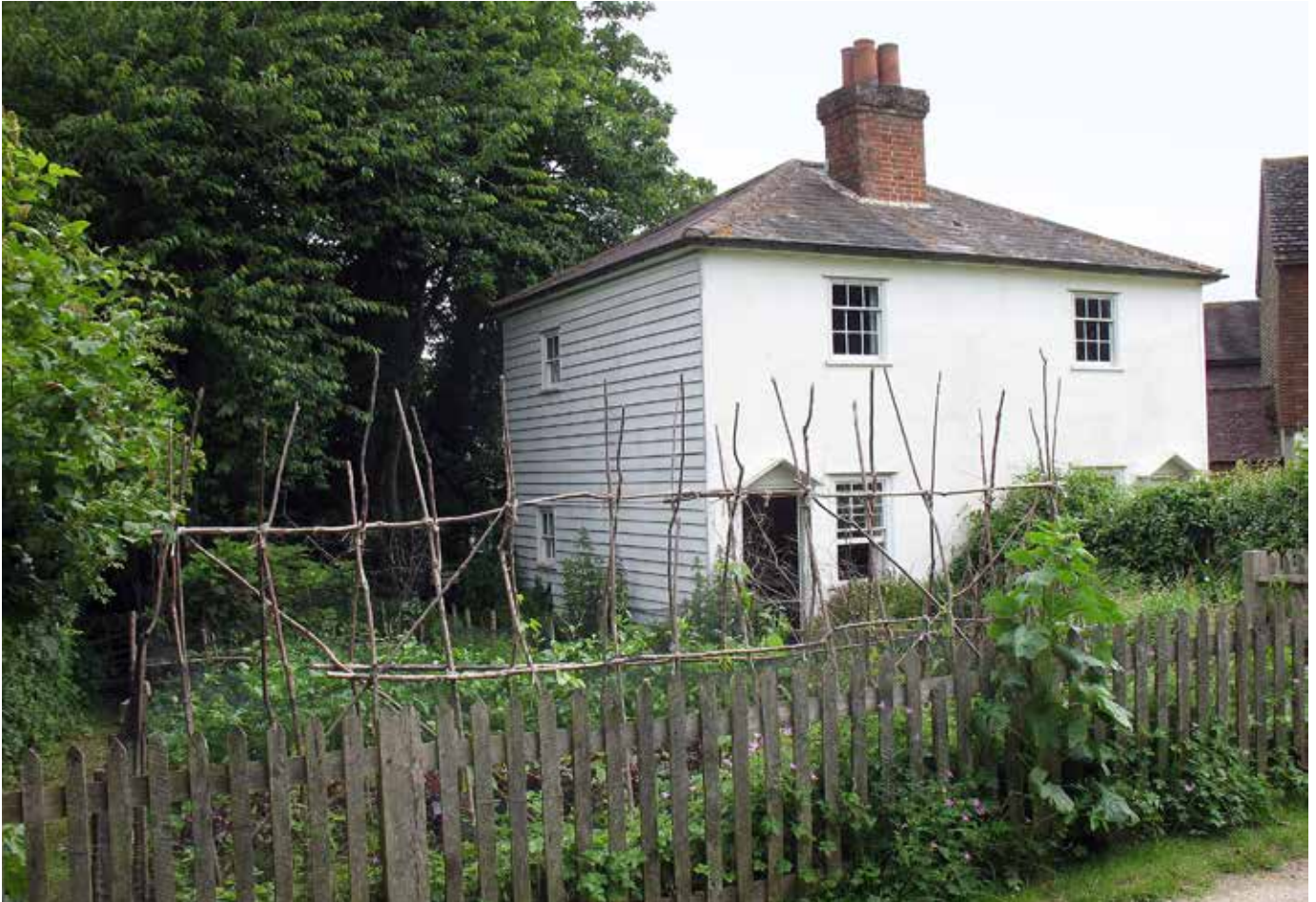
■ Fig. 2. Whittakers' Cottages, c1865.

Similarly, many communities were prepared to allow cottagers the use of common land even if they had no legal entitlement to it because it allowed the occupants a greater degree of economic independence. Landless cottagers generally had no formal common rights, although in practice they might be allowed unofficial 'use rights' – in other words, the lord of the manor and tenants were prepared to turn a blind eye as long as the use of such rights was reasonable and restrained. By exercising common rights the poor could increase their income substantially, supplying the household with essential products like fuel that they would otherwise have to buy (Tankard, 2012, p. 107). There were also a wide variety of wild foods that cottagers could gather including nuts, berries, mushrooms and edible weeds. Those with no sheep of their own could gather loose wool caught on trees and undergrowth to spin into yarn which could then be used to knit coarse woollen stockings. Cottagers might be able to use the resources of the commons to sustain their livelihood, willow ( Salix sp.) for basket making, for example, or hazel ( Corylus avellana ) for hurdle making (Neeson, 1993, pp. 158-184).