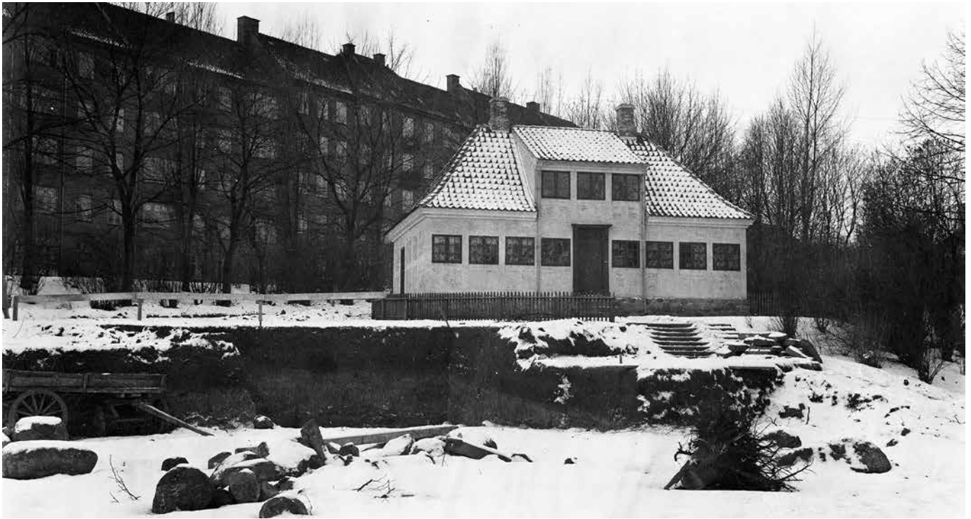
■ Fig. 2. A 1942 winter photo of the 1740s-school from Kerteminde.