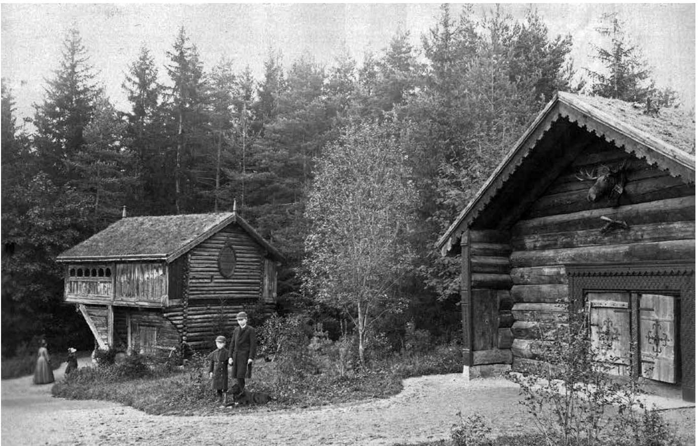
■ Fig. 4. Old wooden architecture in a park setting. (Norwegian Museum of Cultural history, photo: Axel Lindahl, circa 1890)