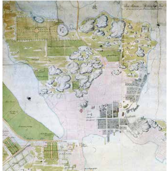
■ Helsinki in 1809. The area of Kaisaniemi Garden is drawn on the map top left. (Wahlberg O.N., Silvan, A., Ekwall, J.V.; Helsinki City Museum, Picture Archives: XIV-17, photoreproduction: Foto Karanen)

Soil samples were collected at four sites with a spade drill sampler one by one, in vertical series from narrow pits. The samples of Naantali Cloister were collected from excavations already in 1996–97. Altogether 174 soil samples were floated and sieved in a laboratory, and macrofossil remains were identified and counted. In total 8 404 macrofossil plant remains belonging to 154 plant taxa were obtained, and 30 AMS-radiocarbon dates were measured from the macrofossils. The oldest dated seeds and grains were medieval, the youngest were modern. Macrofossils included cereals, berries, and ornamental and medicinal garden plants, and cultural or garden weeds, indicating both consumption and garden cultivation at the sites. Past gardening can be seen in soils, in addition to remains of