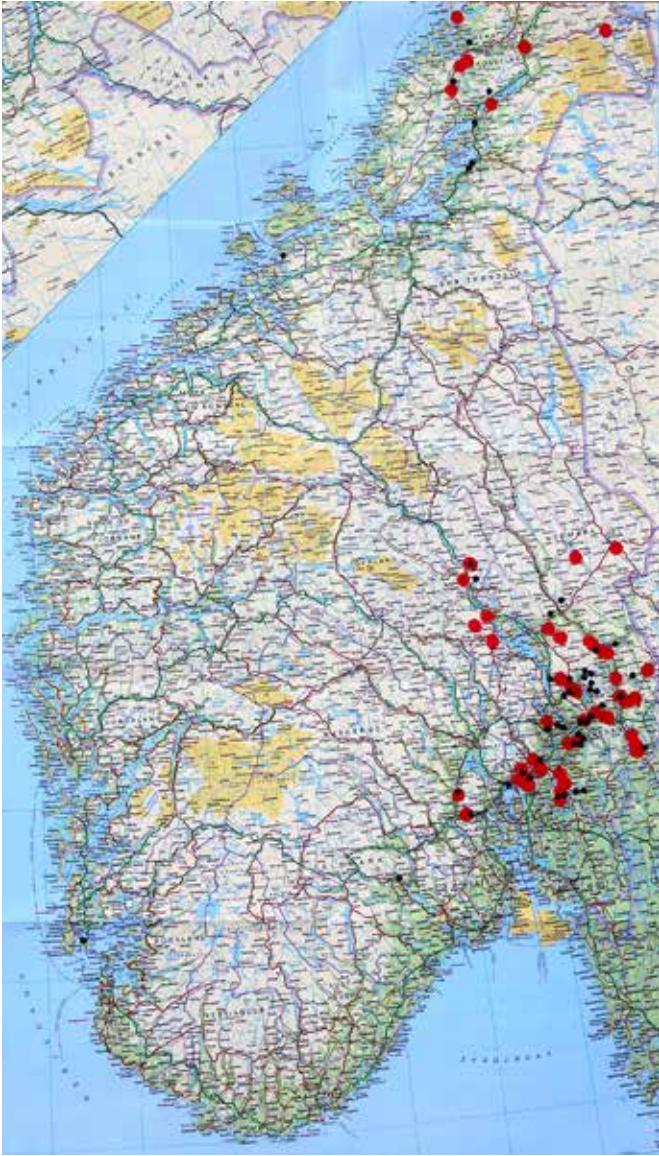
■ Fig. 2. This map shows how Paeonia 'Nordic Paradox' growing in gardens (black dots) corresponds with areas where the Collett family owned forests and farms (red dots). (Map and photo: Mari Marstein/MIA, 2016)

Deeper knowledge gives added value. When I document the plant's context and retell it to our visitors, they recognize their own stories and experience. They make connections to their own past. Beauty to us was often also beauty to the people who lived before us. The way people have decorated their homes and their surroundings with flowers is almost universal, and so is the way we fight the weeds. Fighting the weeds and maintaining the garden is another part of the museum practice. I cannot just collect the plants, put them into the ground and leave them there. Soil improvement, weed control and taking care of the plant's health is an important part. I work in the museum garden with historic methods.