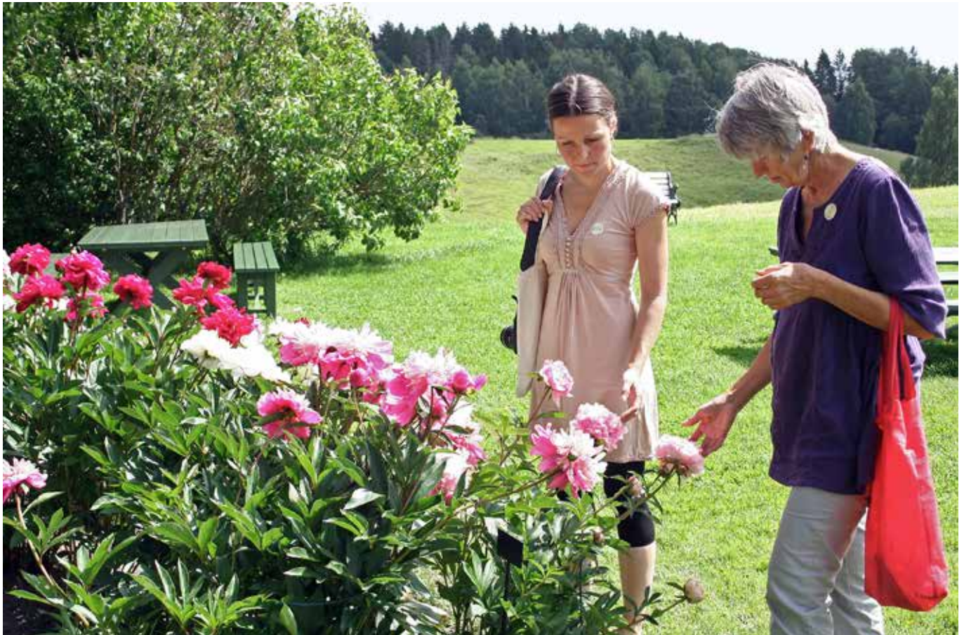
■ Fig. 1. Walking around the garden while talking about the plants and their maintenance is a common social activity, practiced at Gamle Hvam.

There is an increasing public interest in historic garden plants. The collection at Gamle Hvam museum is a successful part of the museum's work. This article is about how museum guests add information to the museum database.