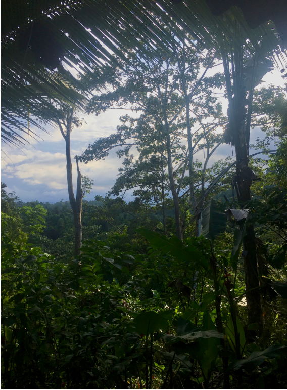
Figure 3-Finca Inti: View from the main house, overlooking zone 1

of the farm is self-sufficiency for a good quality of life, rather than aiming to be a large, commercial farm. He could never imagine living in the city, because on the farm he has everything he needs for “ really living it ”.