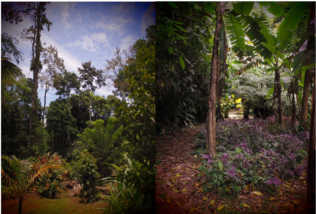
Figure 5- The farm has plants that grow in different layers.

In the beginning, they started with root crops and black pepper. Today, the farm has over 200 different species of fruit trees.