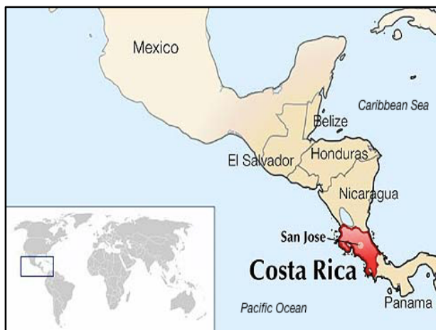
Figure 2- Map of Costa Rica's location (media.radiosai.org 2017)

The small Centro-American country of Costa Rica, measuring 51.100 km 2 (Thuesen 2017), with a population of 4.9 million (INEC 2016). After they abolished their army in 1948, the military budget was redirected to the education, health and environment-sectors, and the country is currently one of the most developed in Central-America (WFC 2017).