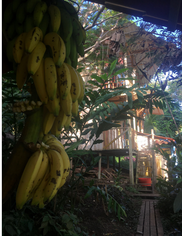
Figure 4- Finca Inti: One of the buildings for housing visitors, constructed with materials from the farm