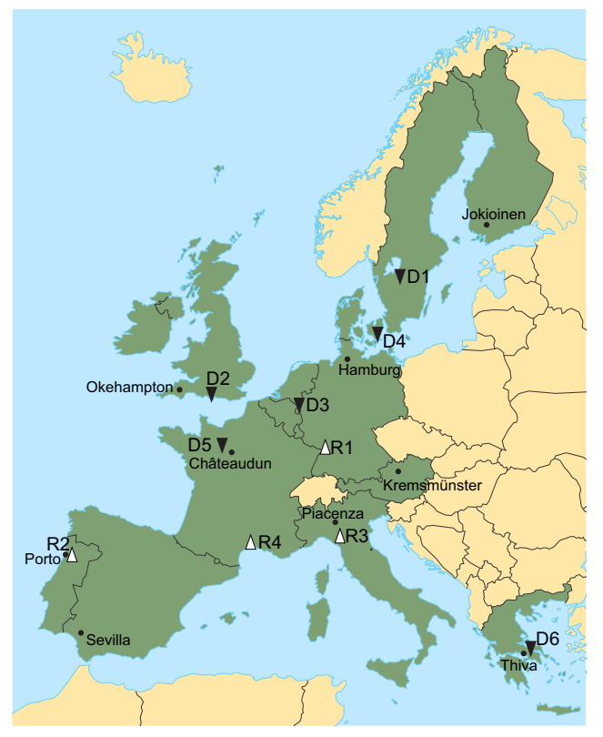
Fig. 2 Location of FOCUS groundwater ( bullet ) and surface water ( black down-pointing triangle = drainage, increment = runoff) scenarios. Adapted from FOCUS 2000, 2001

More work is needed to confirm the capacity of the current FOCUS scenarios for assessing pesticide fate in the northern zone countries. To accomplish this task, it will be necessary to explicitly identify the aspects that define the northern zone with respect to the environmental factors that govern the fate of pesticides in the environment (e.g., temperature, light, rainfall intensity, snow/frost, and soil), and to evaluate this definition in comparison with the currently employed EU scenarios and endpoints. Within the northern zone, there is considerable diversity in soil and weather conditions, as well as in the predominant cropping practices and environmental concerns related to agricultural activities. Previous attempts to specify Nordic reference soils (Tiberg 1998) resulted in the selection and description of 13 different soils from Denmark, Finland, Norway, and Sweden, which were assumed to represent the following: (1) soils covering a large fraction of the Nordic area; (2) soils from the different climatic regions; and (3) environmentally sensitive soils. These efforts require revision and should include the Baltic countries to ensure that proper consideration is given to the common and varying soil