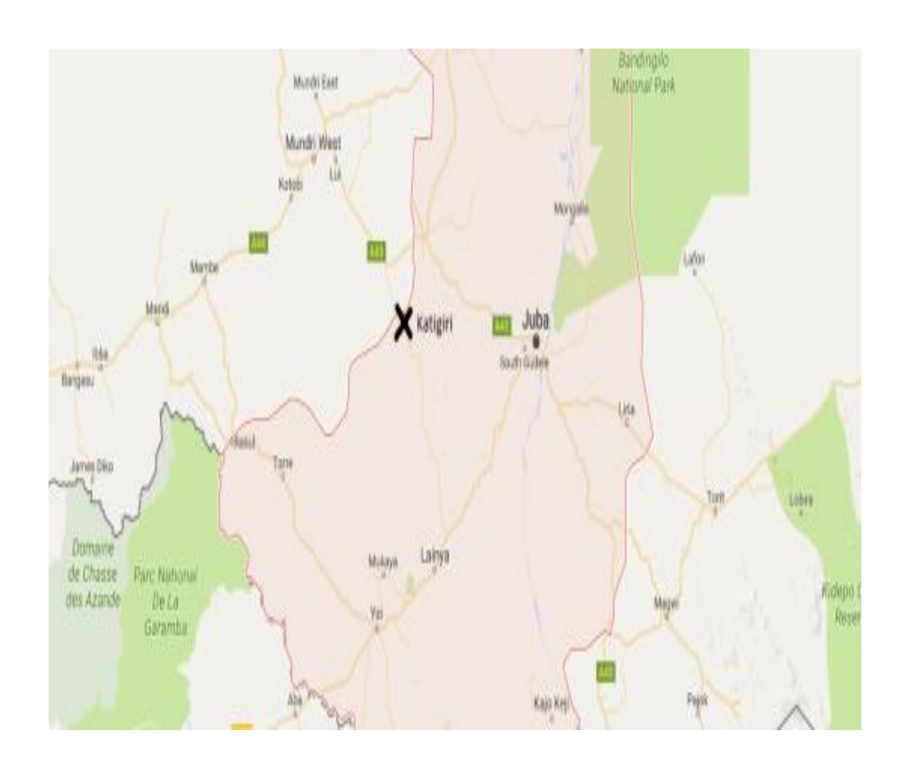
Appendix 2: Map of Central Equatoria state