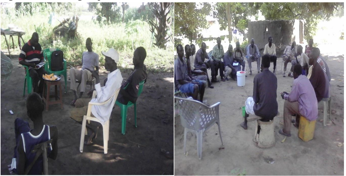
Fig. 4.4 Men focus group discussions