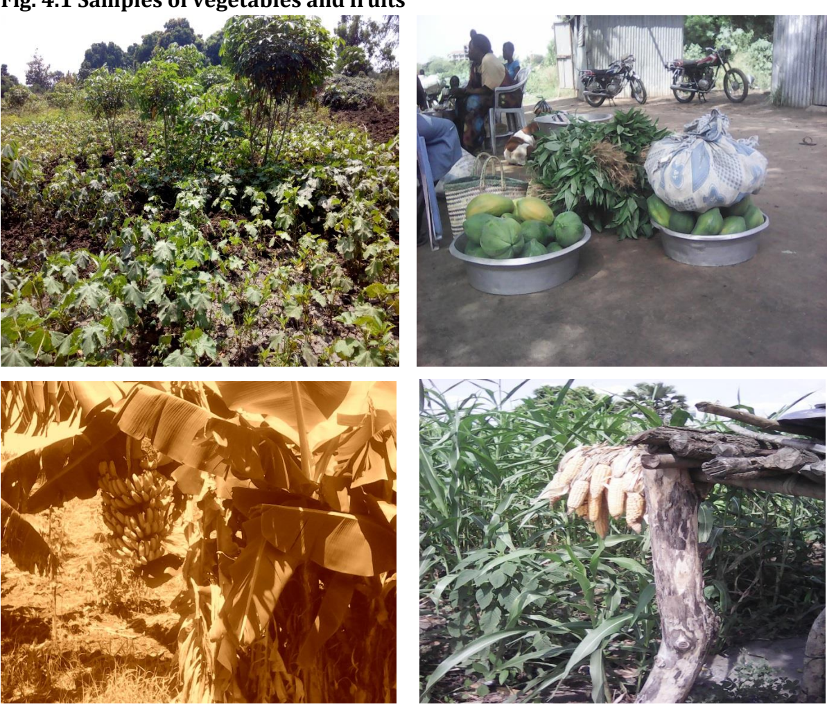
Fig. 4.1 Samples of vegetables and fruits

"We grow vegetables such as ajur, bamia, hudra and gwedegwede. These vegetables take only 45 days to mature. But lodaka(sorghum) requires many months to harvest. We also grow maize yearly. Our people were cultivating far from homestead, but due to insecurity we moved closer to our homes to avoid being killed".