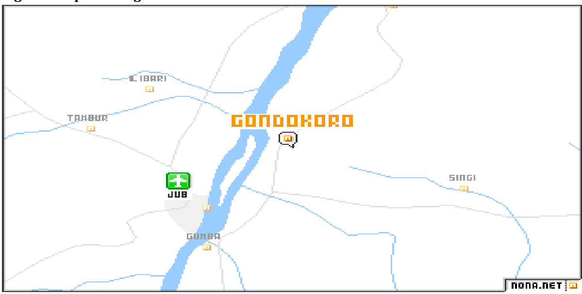
Fig. 3.1. Map showing the location of Gondokoro

Smallholder farmers in Gondokoro depend on rain-fed agriculture for their livelihoods. The rainy season, which is from April to October (and sometimes to November), is the right period for cultivation. During this time, traditional crops planted includes; maize, sorghum, beans, cassava, sweet potatoes along with a variety of vegetables and fruits. With good rains, crops are grown twice in the same farm plot. However, in the dry season, those with generators and people living by the river banks, practice irrigation to cultivate and plant vegetables. Also, smallholders in this area like elsewhere in South Sudan, practice mixed cropping. In the same field, portions of land are allocated for different crops.