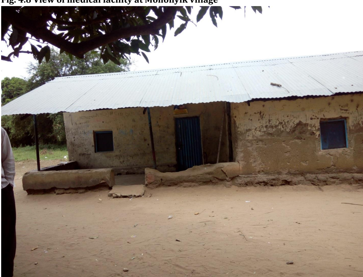
Fig. 4.8 View of medical facility at Mononyik village

"The government does not care about our lives. We are just relying on God's providence. We treat ourselves using local medicines, due to lack of medical facility. This is our major challenge. Since there is no hospital here, we take our sick persons to Juba. Again, it is difficult to transport the sick to Juba teaching hospital because the road is bad. Cars rarely come to this area in the rainy season. So, canoes are the only means of transport that helps us. Tell your government to build a hospital for us". (Male interviewee from Yamba village).