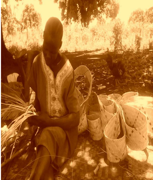
Fig. 4.9 View of off-farm activities smallholders do to get money

Although farmers perform off-farm activities to generate additional income, they don't abandon agricultural work (Netting, 1993). Smallholder farmers in Gondokoro burn charcoal and make papyrus mats to get money. Charcoal production is a business that is carried out by men. But mat making is done by both men and women. Such activities are intensified when crops fail due to insufficient rains.