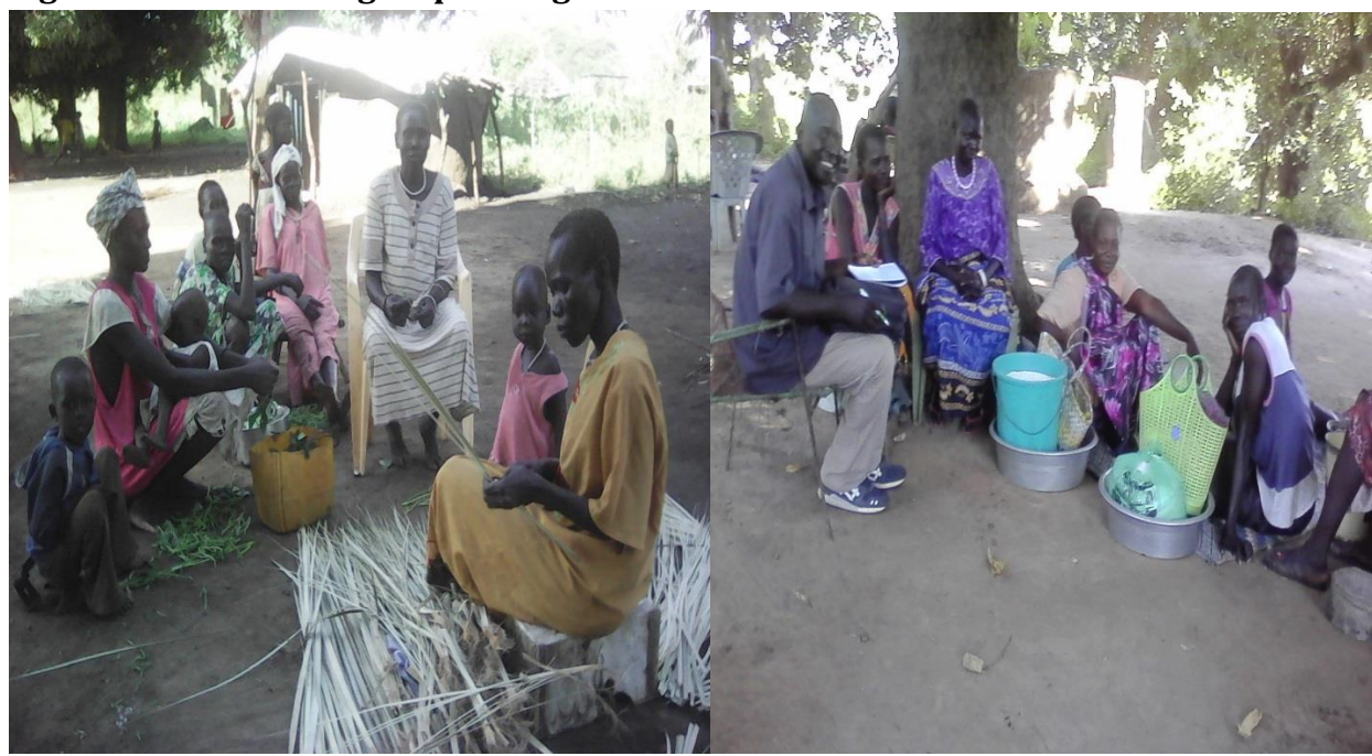
Fig. 4.3 Women focus groups doing homework

"We are also facing problems of seeds. Previously, some non-governmental organizations used to provide seeds for us but not fertilizers. They told us to buy fertilizers from the market using our money. One time the NGO's gave us rotten seeds. And after planting they never germinated and that annoyed us very much. Some Non-governmental organizations have deceived us many times. They tell us do this and that, but at the end they give no help. We are cultivating small land due to lack of seeds. Being a widow makes matters worse for me, because there is no man to help me in the farm. The land I am cultivating is the one left by my late husband".