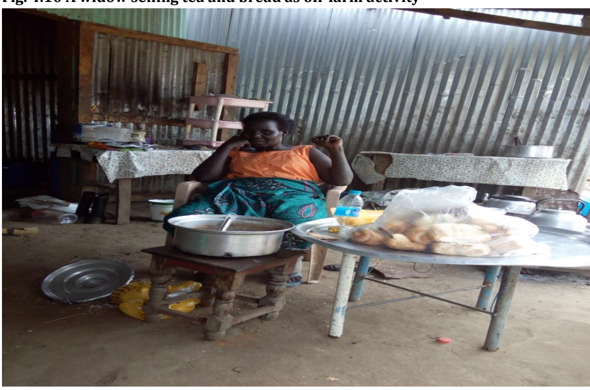
Fig. 4.10 A widow selling tea and bread as off-farm activity

"I sell tea in the market and beer at home to provide for my children. The profit I make, goes for the school fees and food in the house. However, I am still unable to cover all the basic needs of my children. Sometimes, I fail to pay all my children's' school fees"