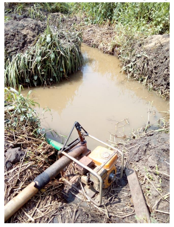
Fig. 4.2 Smallholder farmer irrigating his crops