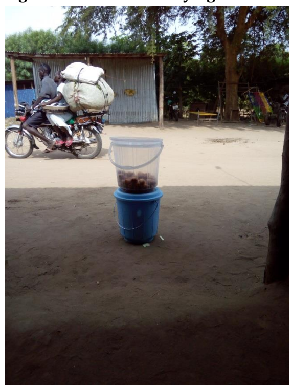
Fig. 4.6 Motorbikes carrying women and their food crops to the bank of river