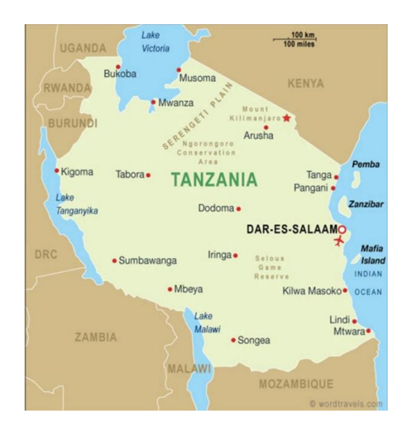
Figure 2.2.1: Map of the United Republic of Tanzania