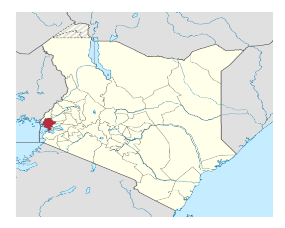
Figure 1: Map of Kenya showing location of Siaya County in Red.

worked closely with the former office of the prime minister (GoK 2010). By late 2010 new climate laws were formalized in the new current constitution and devolved to all the 48 County government levels (GoK 2013). Climate Change Coordination Unit (CCCU) remained at former Office of Prime Minister and continued to provide high-level political support to climate change activities. The CCCU received additional support from Kenya climate change secretariat at the ministry of environment (GoK 2013). The two committees (CCCU and Secretariat) adhere to new 2010 constitution as an institution in following the climate change farming norms and legal rules of climate governance especially on agricultural and forest conservation laws and policies. This is aimed at Kenya's Vision 2030 with purpose to enhance and transform smallholder agriculture productivity (FAO 2014).