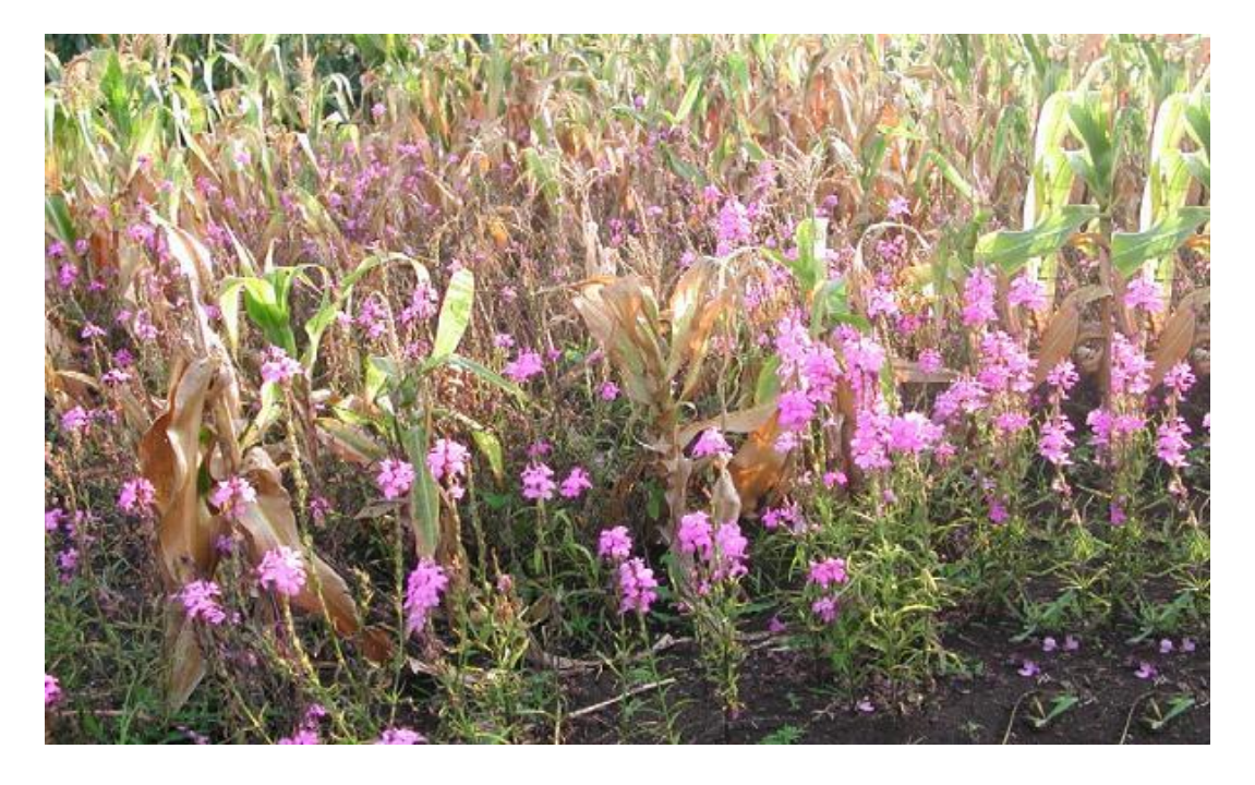
Figure 4: New Striga weed (purple flowers) in a plot of maize affecting crop. Striga emerges as a result of changes in local climate change.

problems occasioned by destruction of local trees for charcoal, timber and firewood for sale on market (PAI 2014). This also aims at salvaging drying local springs and water streams due to prolonged incidences of climate change drought and also occasioned by increasing vulnerability from flash floods runoff from denuded grounds in some parts of Alego Usonga (SRCF 2009). Water body streams and local springs are important for small scale sustainable agricultural production and drinking clean safe water can eliminated rampant diseases exposures occurring due to poor sanitation like diarrhea and cholera outbreaks a common illness in Lower Nzoia (FAO 2014). The national policy concern initiated in five year action plan was to harmonise climate change and adaptation processes, national, county and sub county government laws and bylaws with regards to agricultural development and food production, land issues and environmental conservation.