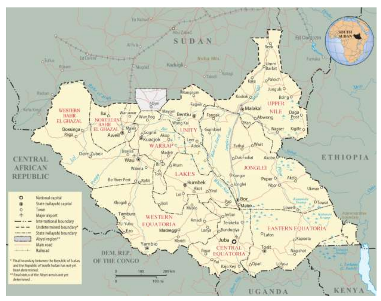
Figure 3 Map of South Sudan (Geographic Guide African Countries, 2016).

South Sudan is located in north-eastern Africa. It shares its boarders with six countries: Sudan, Ethiopia, Kenya, Uganda, Central African Republic and DRC (see figure 3). The population is estimated to be around eight million with more than sixty ethnic tribes. There is constant conflict between these tribes over land, pasture and other resources. In addition there are constant disputes over boarders and other internal conflicts between government and rebel groups. This instability causes the country to remain underdeveloped. The country is divided in 10 major regions (see figure 3). The regions in the north-east, The Upper Nile, Unity, Jonglei are the most insecure areas due to constant fighting and the high amount of various active rebel groups. (Machakanja, 2014). Almost all South Sudanese are Christians or followers of traditional religions (Copnall, 2014).