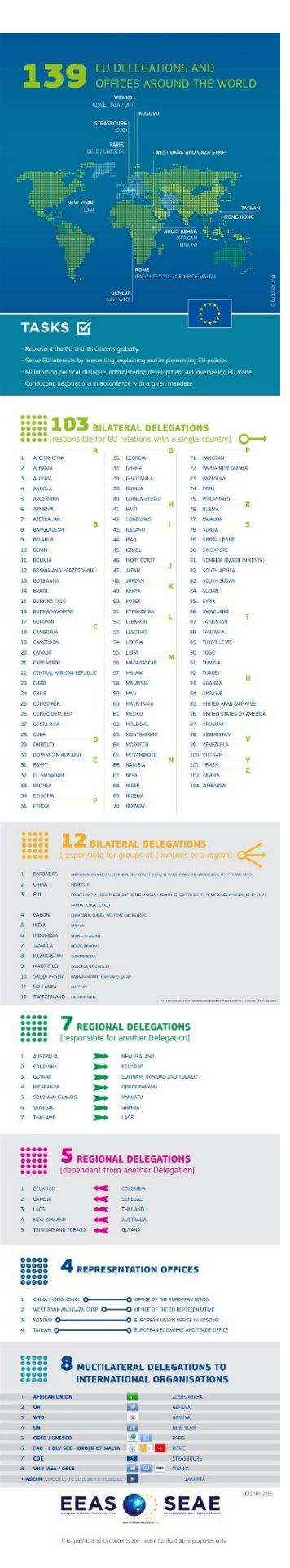
Annex 2. EU Delegations and Offices around the World (infographic)