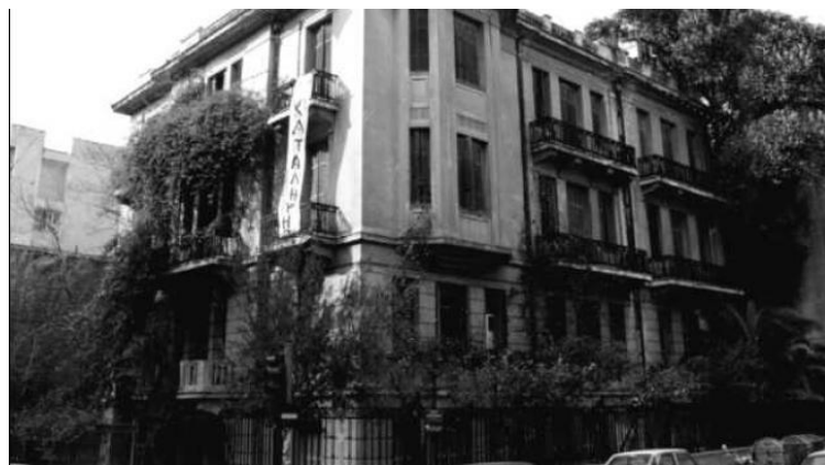
Pic 2: The Lela K. building. A classic 1930's building, just outside the then center of Athens. Kypseli neighborhood was an area of wealthy families and rich residence.

Stayropoyloy, was the headquarters of her resistance organization. The building by itself is a classic '30s building. In Athens's city center, we can still see buildings from different eras and architectural cultures. The neighborhood of Kypseli, belongs the municipality of Athens,