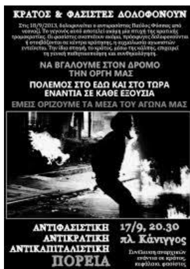
Pic 7: A brochure of a similar demonstration. From the top to bottom: "State & Fascists assassinate. Lets gather to the street our anger. War now and here against every authority. Anti-fascist- Anti-State- Anti-capitalistic demonstration

In this important meeting, almost 250 gathered there. We decide to demonstrate in front of police headquarters, and then demonstrate in the city center against the police violence and the law enforcement on political refugees. Some hours later, a massive demonstration of 1500-2000 comrades was in street of the city center. The target that day