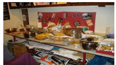
Pic 4: The buffet. A lot of food was provided by people who visit us that day.

The building itself has a backyard that children can play there, without the fear of cars etc. The food was planned to be served at around 13.00. The preparations was slowly, although in such action, someone can barely see stressed comrades. Everything took its time to be prepared and at around 13.30