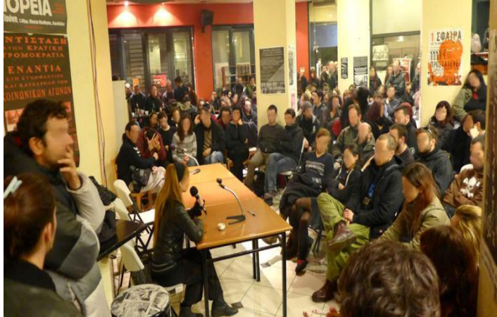
Anarchists' meeting and debate in a squat.

In this point, I have to underline that my research plan was to approach some State official and the Police. Later, I decided not to include them in the research. Some of the reasons are: