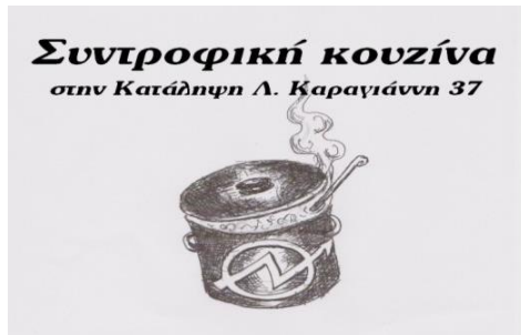
Pic 5: 'Collective cuisine in L.Karagianni 37 squat

In 24 th of March, the squat decides to have a collective cuisine for immigrant, refugees, comrades and homeless people for the neighborhood. It was decided in the meeting of the previous week.