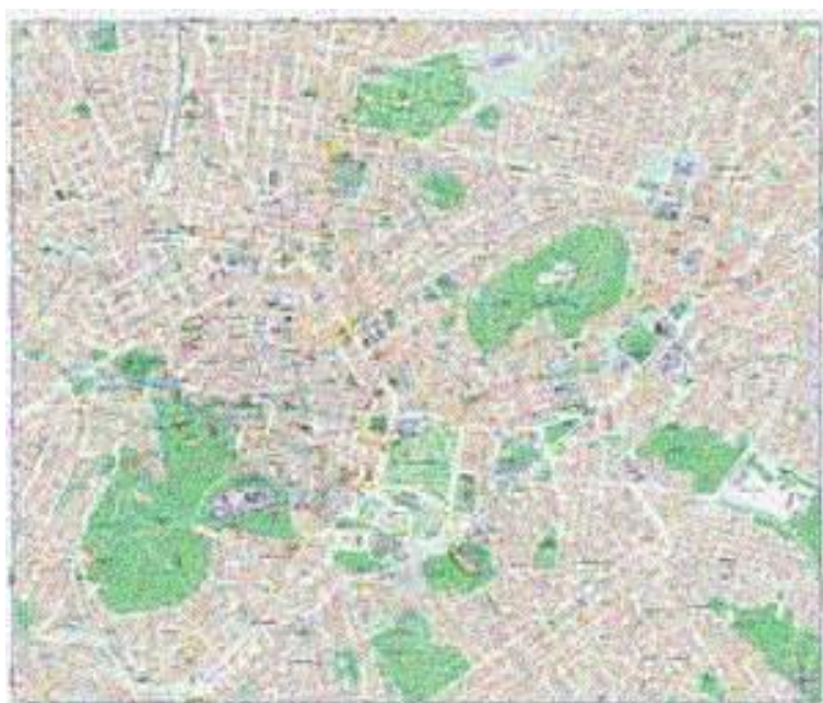
Pic 1: Map of Athens' city-center

The political center of Greece is definitely, Athens. Not only the government's authorities but also the main headquarters of the country's bureaucratic institutions are established in the city center. Following this, all the resistance and antiauthoritarian movements are mainly established in the city center or around that. The social processes of the previous century were