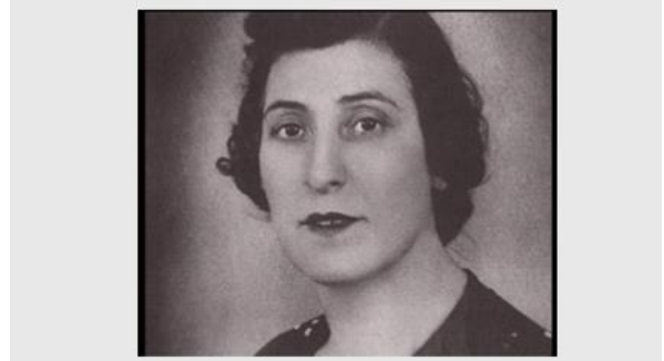
Lela Karagianni before World War 2.

Following the arrest by the Gestapo, she was transferred to the Es-Es headquarters, imprisoned by wild torture methods. Although, she never revealed names or identities of other resistance fighters. After the prison and the torture, she was transferred to the concentration camp of Haidari, and finally executed with 27 more resistance fighters on the 8 th of September 1944. The execution took place some weeks before the victory of the Greek Resistance against the Nazi Germany.