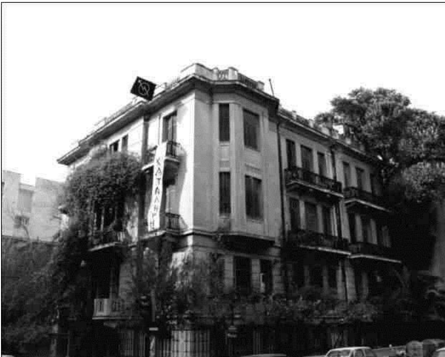
Pic1. Lela K.37 anarchists' squat building.

The topic of this thesis is about the self-organized (anarchist's) entity and its