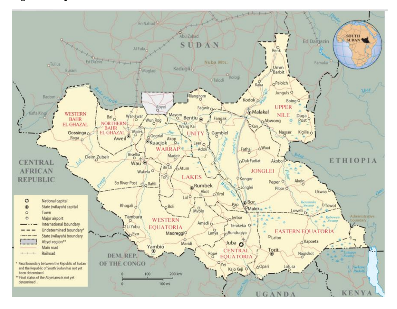
Figure 1 Map of South Sudan

Norway's operations in South Sudan include: humanitarian aid, development and diplomacy. As we shall see later in chapter 5. Norwegian organizations work closely with the Norwegian Ministry of Foreign Affairs in their engagements in South Sudan.