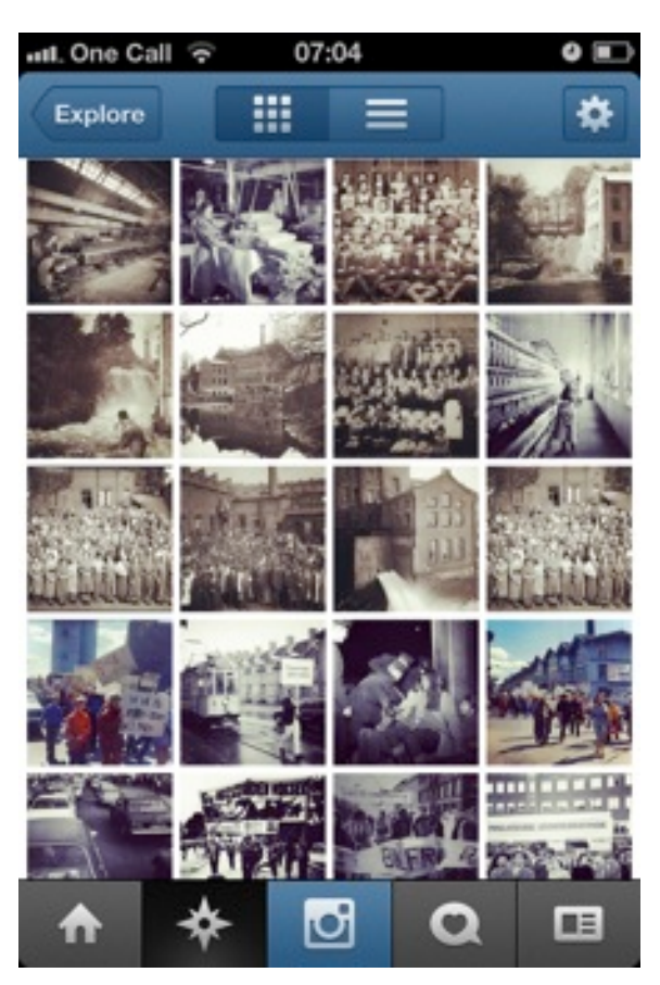
Figure 1. @Akerselvadigitalt photo stream on Instagram

Beginning investigation into the presence of Akerselva on social media revealed the Instagram photo stream, #akerselva, where citizens seemed to share natural as well as social and culinary experiences. Therefore, the first investigation centred on using Instagram as a distribution channel for historical images within this already established mediated relationship. Images for the experiment were curated from the open photo database oslobilder.no provided by the Oslo Museum, and the portal industrimuseum.no provided by the Norwegian Network for Industrial History. We established a new Instagram stream, @akerselvadigital, to allow people the ability to follow these curated archival photos.