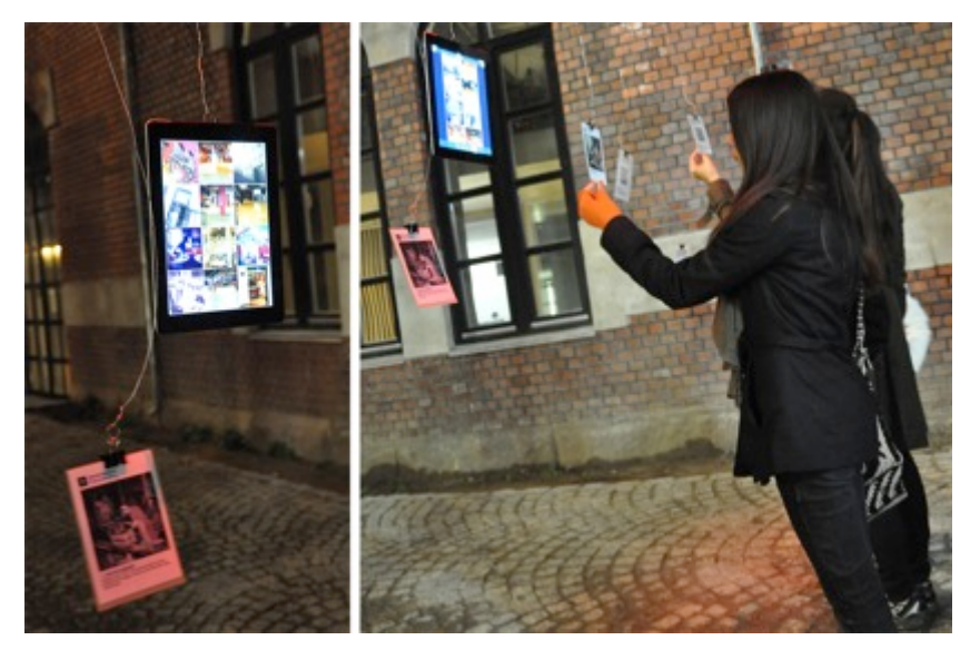
Figure 3. One of the three installation sites. iPads were available for viewing the photo stream in real-time (left), with cards containing text prompts to encourage interactions by way of the QR codes.

Printouts were made of the @akerselvadigital stream photos, scaled 200%, and marked with a QR code. These printouts were then laminated for durability and strung at the specific site relevant to each theme. The QR-codes on the laminated printouts linked users directly to the Instagram stream, making an onsite connection between the physical site where the event occurred and the digital space being curated on Instagram. Accompanying text and questions were intended as trigger points for reflection over contradictions between the past and now. In inviting river walkers to access by way of QR-codes, we hoped to provide an incentive to participate by adding their own photos or comments stimulated by the prompting texts.