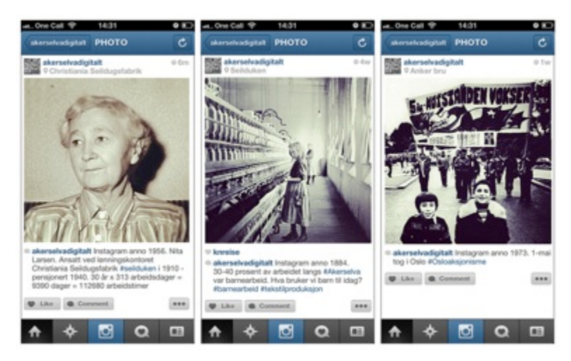
Figure 2. Photos from the archives published through Instagram

All photos were tagged with the #akerselva hashtag, and with clusters of hashtags that drew attention to themes related to Akerselva history. The themes could be related to: