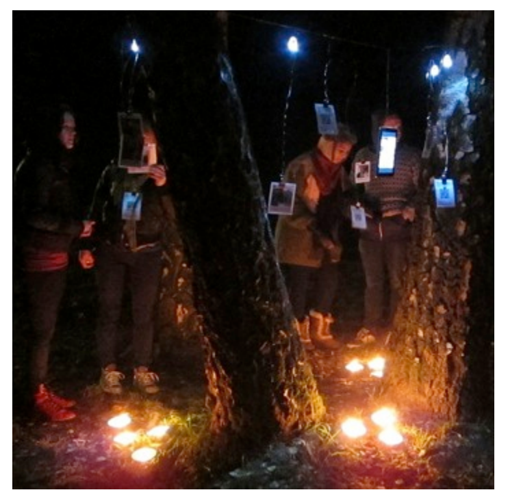
Figure 4. The most popular installation site of the three locations

It became clear that defining the features for participation had to be explained differently for both the digital and physical spaces. The physical translation of the Instagram photos on to laminated cards seemed to require more descriptive text and a clearer prompting to act than the photos that were experienced within Instagram on the mobile phone. The physical text had to be designed with a clear idea of what kind of contribution people could make that was relevant for their situated context of the walk – and how the user-made Instagram contributions would fit within the museum framework. People participating in the walk constantly uploaded photos of installations and situations experienced and hashtagged with #akerselva, making it difficult to find ways to tune them into historical reflections in this context. The requests articulated in our Instagram entries did not work well in crossing contexts between online and physical representations. And it seemed that translating the Instagram photo and hashtag texts into a physical form required another level of prompting – a physical invitation which set out verbatim instructions on what the user was to do in the interaction.