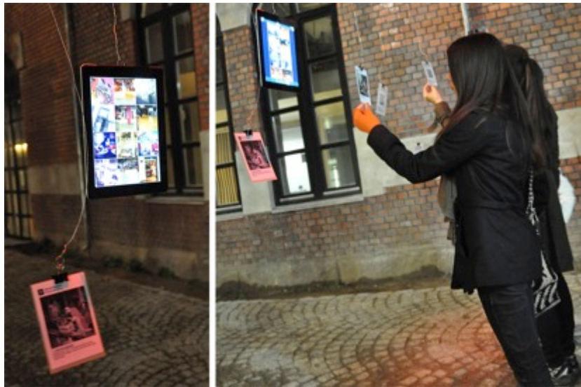
Figure 3. One of the three installation sites. iPads were available for viewing the photo stream in real-time (left), with cards containing text prompts to encourage interactions by way of the QR codes.

Printouts were made of the @akerselvdigital stream photos, scaled 200%, and marked with a QR code. These printouts were then laminated for durability and strung at the specific site relevant to each theme. The QR-codes on the laminated printouts linked users directly to the Instagram stream, making an onsite connection between the physical site where the event occurred and the digital space being curated on Instagram. Accompanying text and questions were intended as trigger points for reflection over contradictions between the past and now. In inviting river walkers to access by way of QR-codes, we hoped to provide an incentive to participate by adding their own photos or comments stimulated by the prompting texts.