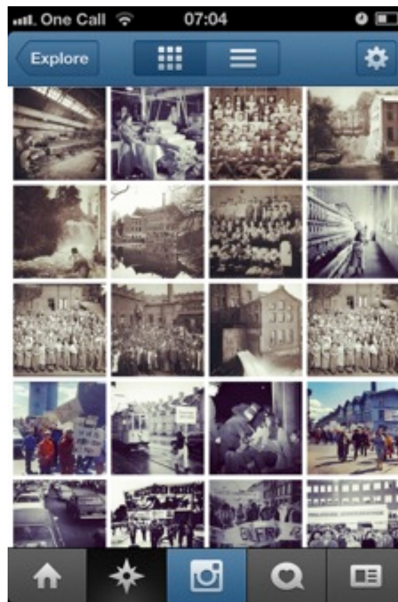
Figure 1. @Akerselvdigitalt photo stream on Instagram

Beginning investigation into the presence of Akerselva on social media revealed the Instagram photo stream, #akerselva, where citizens seemed to share natural as well as social and culinary experiences. Therefore, the first investigation centred on using Instagram as a distribution channel for historical images within this already established mediated relationship. Images for the experiment were curated from the open photo database oslobilder.no provided by the Oslo Museum, and the portal industrimuseum.no provided by the Norwegian Network for Industrial History. We established a new Instagram stream, @akerselvdigital, to allow people the ability to follow these curated archival photos.