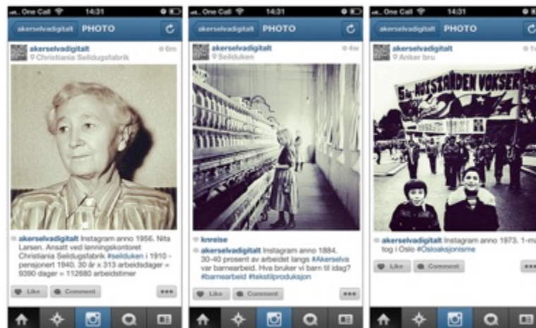
Figure 2. Photos from the archives published through Instagram

All photos were tagged with the #akerselva hashtag, and with clusters of hashtags that drew attention to themes related to Akerselva history. The themes could be related to: