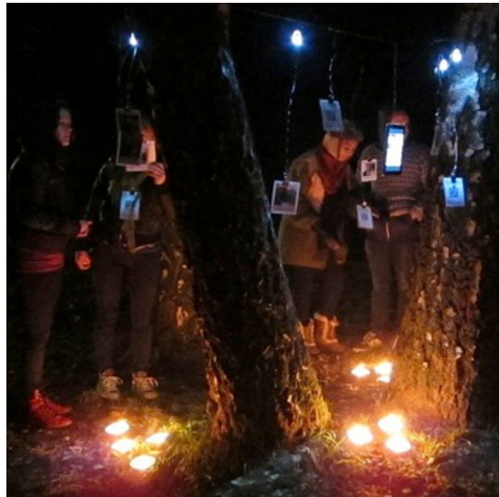
Figure 4. The most popular installation site of the three locations

It became clear that defining the features for participation had to be explained differently for both the digital and physical spaces. The physical translation of the Instagram photos on to laminated cards seemed to require more descriptive text and a clearer prompting to act than the photos that were experienced within Instagram on the mobile phone. The physical text had to be designed with a clear idea of what kind of contribution people could make that was relevant for their situated context of the walk – and how the user-made Instagram contributions would fit within the museum framework. People participating in the walk constantly uploaded photos of installations and situations experienced and hashtagged with #akerselva, making it difficult to find ways to tune them into historical reflections in this context. The requests articulated in our Instagram entries did not work well in crossing contexts between online and physical representations. And it seemed that translating the Instagram photo and hashtag texts into a physical form required another level of prompting – a physical invitation which set out verbatim instructions on what the user was to do in the interaction.