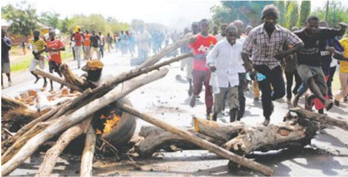
Figure 1: shown below observe the protest of the Mtwara community, especially the youth, toward the government of Tanzania on transferring of gas to Dar-es-Salaam