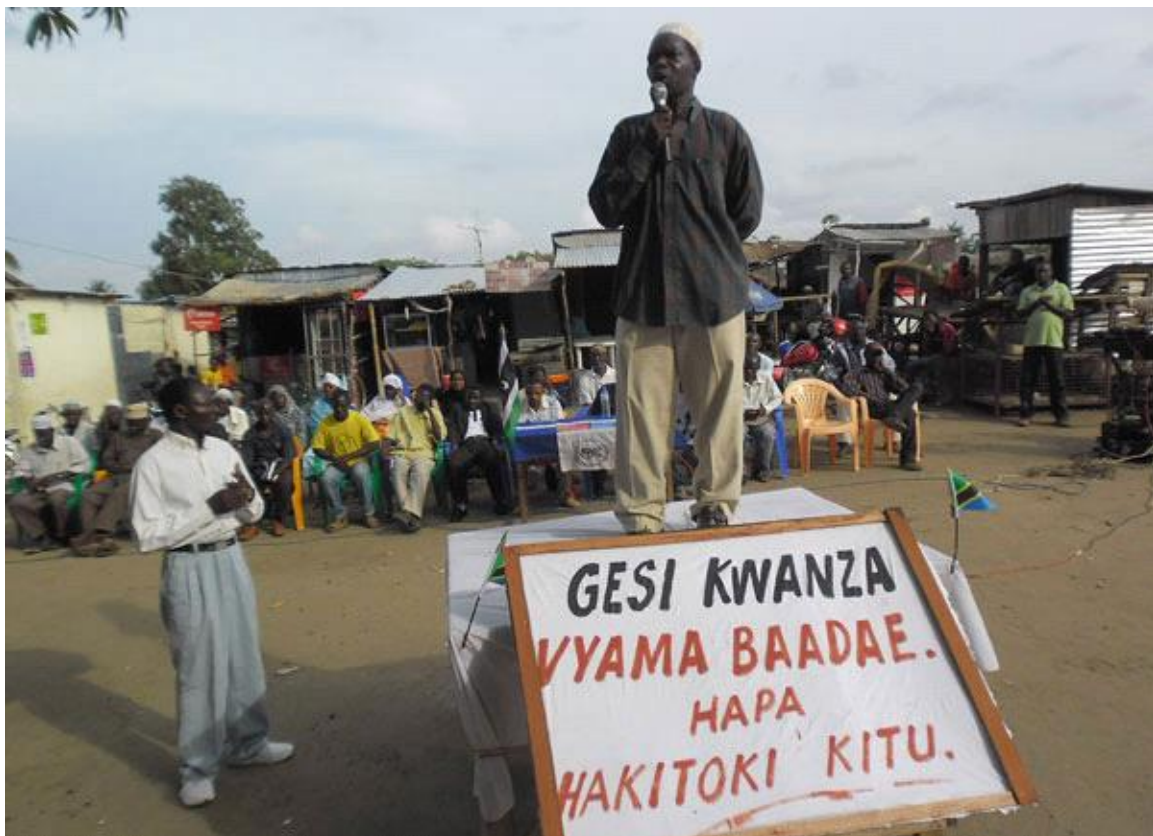
Figure 4 shows a meeting coordinated by elders in Mtwara showing their protest on the construction of a gas pipe line to Dar-es-Salaam.

Unequal share is another cause of violence in Tanzania. This has resulted in employment of know-whom rather than know-how in most of the government sectors known as threats to peace. There has been no tangible solution to the problem of youth unemployment, a situation which has led to a rise of youth gangs in both urban and rural areas. These youth are looking for every possible chance for survival, thus becoming a threat to business owners and loyal citizens. This creates a situation of both fear and hate between one group and another in any given community; efforts must be taken to prevent further deterioration of the situation.