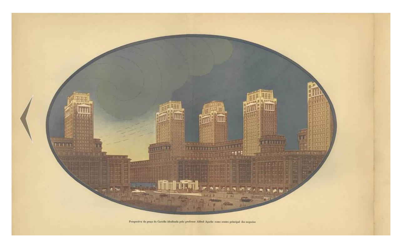
Praça Castelo, former Castelo mountain, as visualized in downtown Rio by Alfred Agache

Plano Agache (Agache 1930) was the next master plan. The execution of the plan is not regarded as successful as the Perreira Passos, but it is still very relevant. It followed the same ideology. The bairros (neighborhoods or districts) were designated to each their clear cut function - industrial, business, noble residential, tourism etc. Transportation leading to downtown Rio needed more efficiency and in order to go through with the plan there was made room for a highway of six lanes, todays Avenida Presidente Vargas, and cutting through the city center. Entire mountains as Morro do Castelo and Morro de Santo Antônio was removed to make room for skyscrapers and the city center airport, Santos Dumond was eventually inaugurated in 1936 on landfill from the mountains. The justifications made to clear the mountains are of economic, hygienic and aestetic character. The need for efficient land, the supposed winds created by hills, but also the "state of mountains" are all mentioned in Plano Agache (1930) as reasons for removing the mountains.