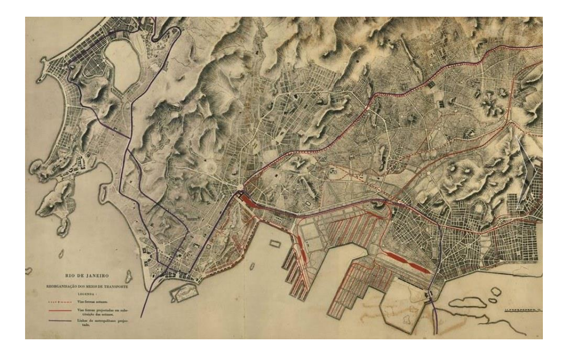
Plan for new transportation system as in Plano Agache (blue road, red railroad)