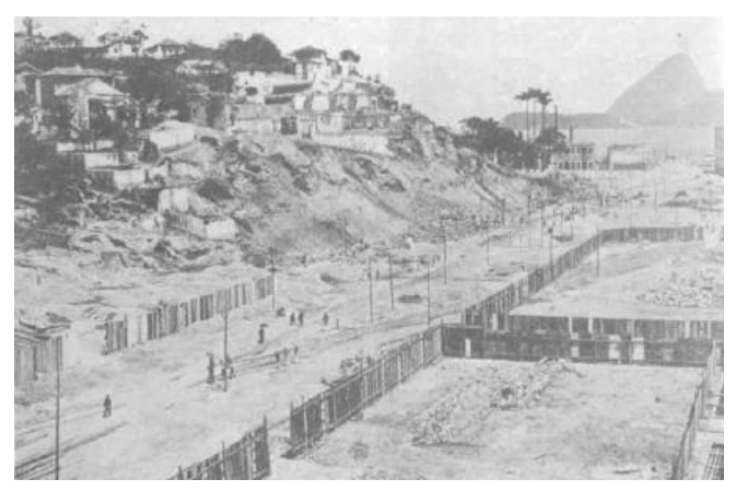
Ground of Avenida Central and hillside of Morro do Castelo in 1905. The Mountain was entirely removed in 1921 (Benchimol 1990)

Poor neighborhoods were partially or entirely removed in the process of modernizing the city and entire hills were poor people had settled were removed, among them 1691 tenements and an unknown number of favelas were destroyed during the process (Perlman 2010). Pereira Passos did not only change the physical appearance of the city, but he implemented a large amount of new harsh laws that were directed to combat unmodern costumes, like milking cows or selling meat in the streets. A big revolt was provoked by a new law of mandatory vaccination as many did not trust the authorities and was intimidated by the invasion of their privacy.