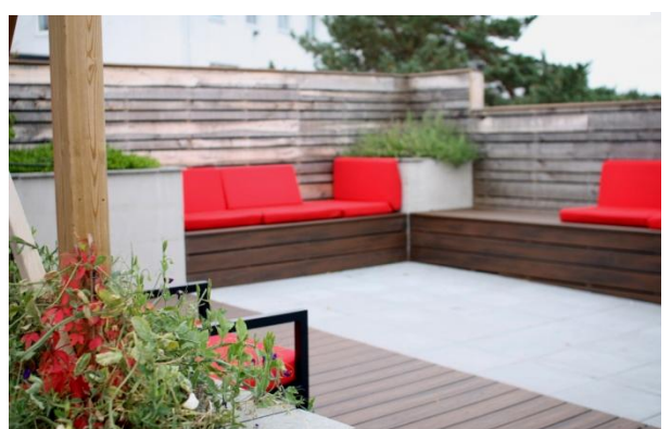
Figure 4 One corner of the terrace's inner part