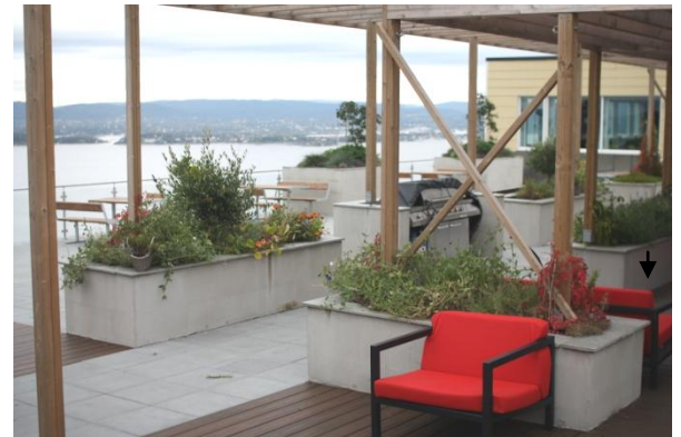
Figure 3 Terrace seen from the inner part.