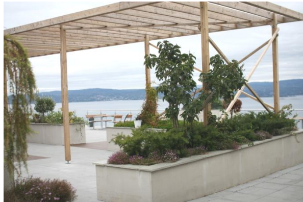
Figure 4 Terrace and the pergola seen from the entrance