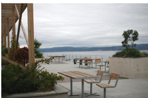
Figure 6 Outer part of the terrace with tables and chairs