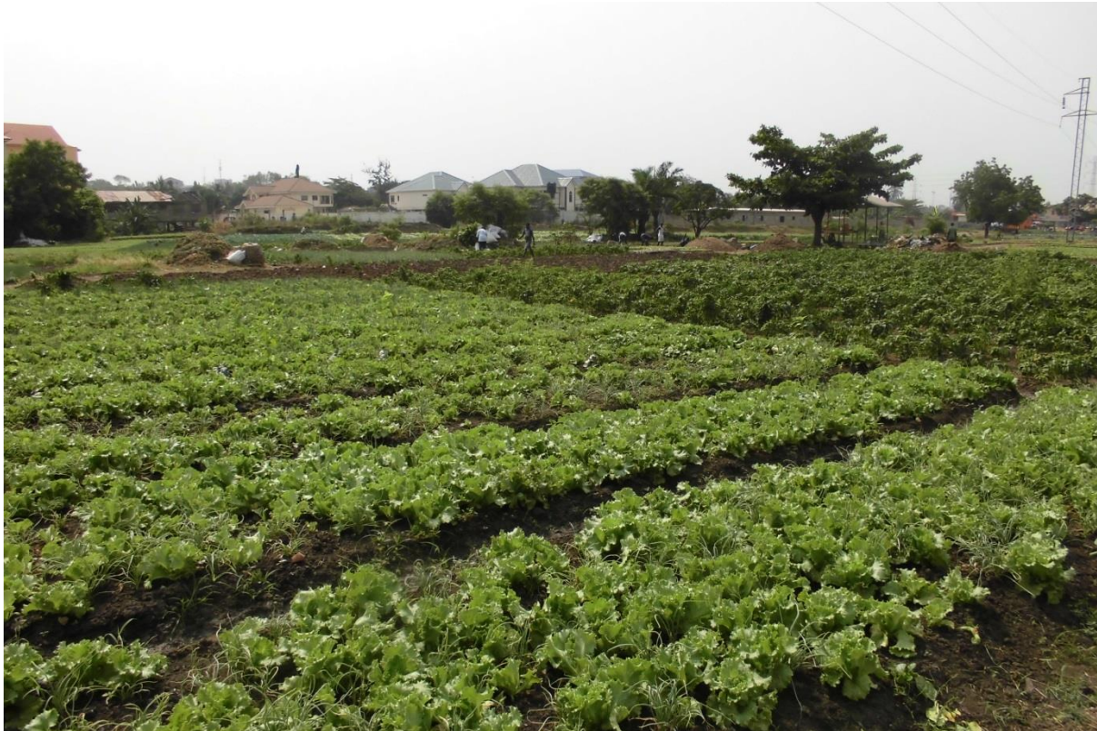
Fig. 1 Vegetables growing on raised beds at Dzorwulu Plant Pool site