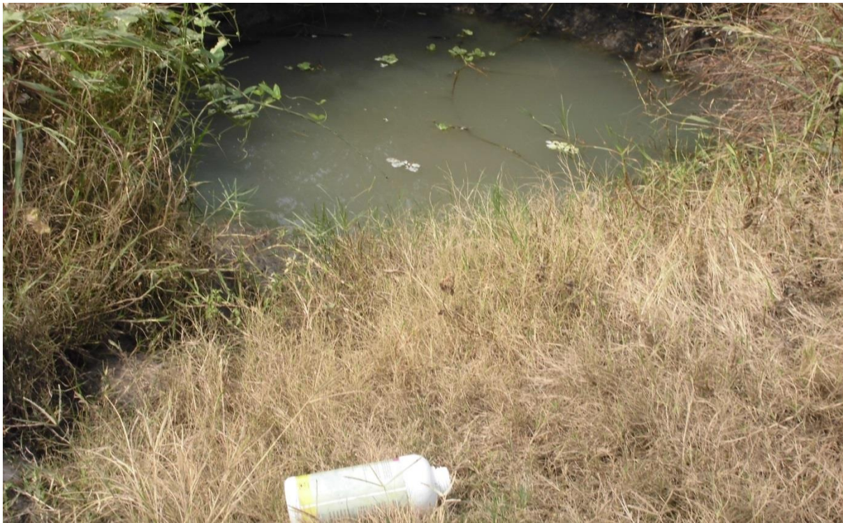
Fig. 5 Used pesticide containers disposed near a water body at the site.