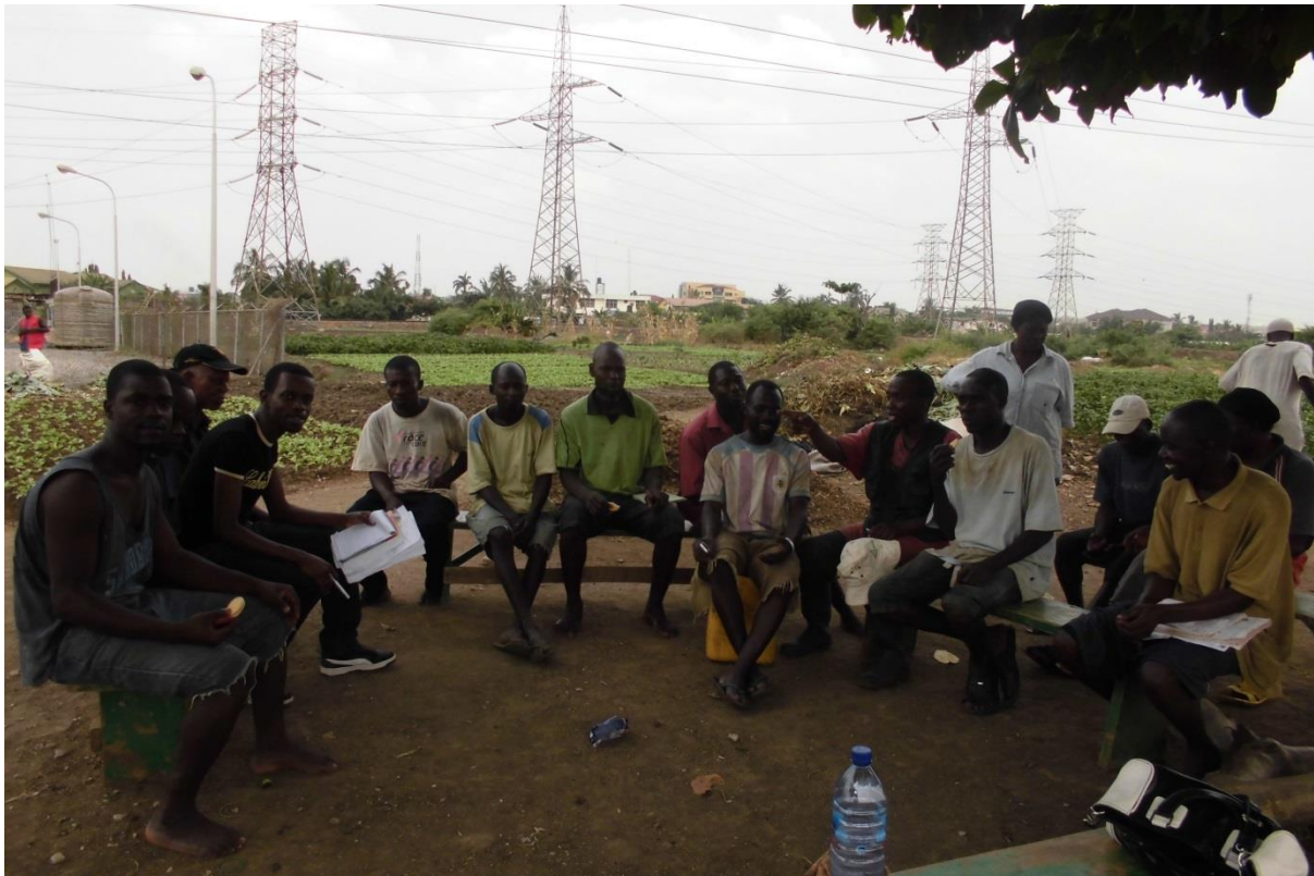
Fig. 6 Discussion with farmers about alternatives to pesticide use