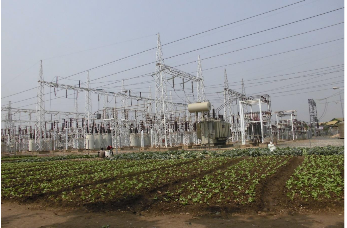
Fig. 3 The Dzorwulu/Plant Pool site

Dzorwulu Vegetables Farmers Society. The well-organized nature of the Dzorwulu Plant Pool farmers has made them a target for many intervention programmes by both government agencies as well as local and international Non-Governmental Organizations (NGOs).