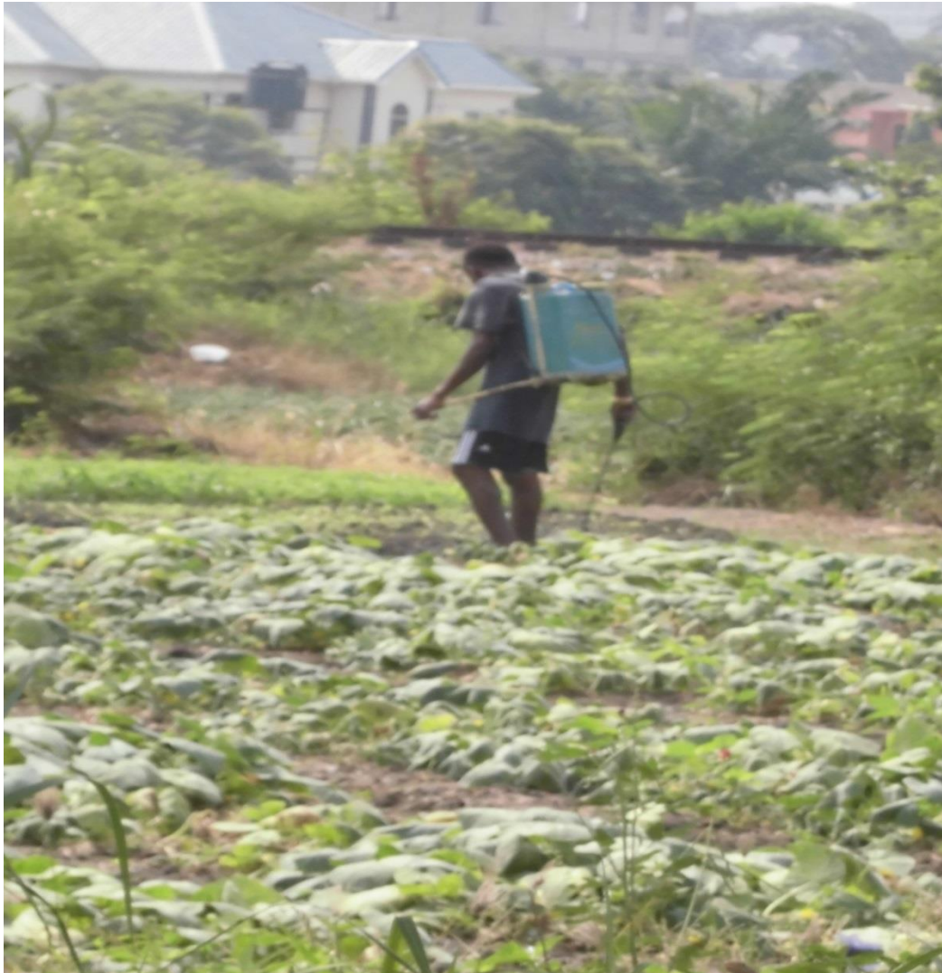
Fig. 4 A vegetable farmer spraying pesticide with no personal protective clothing.