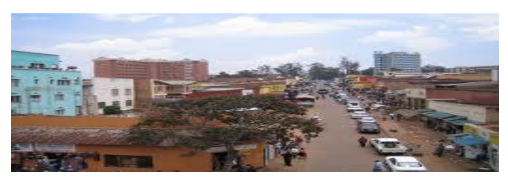
Fig. 5 Kigali Centre

expats. I observed how intensely most women at these restaurants and bars behaved towards the development aid male workers when enjoying his after-work- and weekend drink. They would literally get into fights with one another in order to get to a man up close for his attention. The 100 dollar bills these men gladly handed out were apparently never in a bashful or ashamed manner, but rather with a proud and laid-back attitude of "Boys will always be boys. End of discussion"