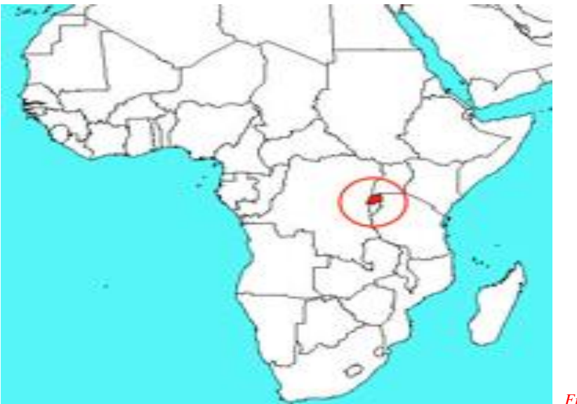
Fig 1. Rwanda