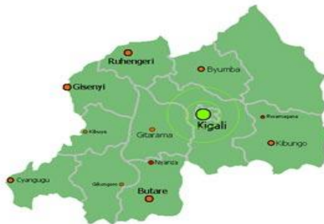
Fig 2 Kigali