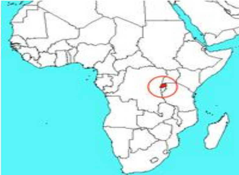
Fig 1. Rwanda