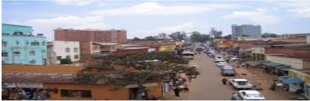
Fig. 5 Kigali Centre, Google Pictures

expats. I observed how intensely most women at these restaurants and bars behaved towards the development aid male workers when enjoying his after-work- and weekend drink. They would literally get into fights with one another in order to get to a man up close for his attention. The 100 dollar bills these men gladly handed out were apparently never in a bashful or ashamed manner, but rather with a proud and laid-back attitude of “Boys will always be boys. End of discussion”